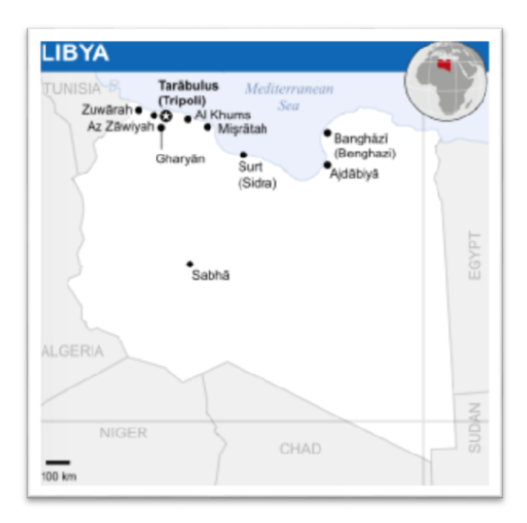
Figure 2.1: Map of Libya

In order to explore the attitudes towards people with ID in Libya, it is important to have a clear idea about the country. This section is divided into two parts: the first part illustrates Libya and Libyan culture; and the second part explores Libyan attitudes towards people with ID. Geographically, Libya is a north-African country situated on the southern coast of the Mediterranean Sea bordered by Egypt to the east, the Sudan to the south east, Chad and Niger to the south, Algeria to the west and Tunisia to the north-west (see Figure (2.1).