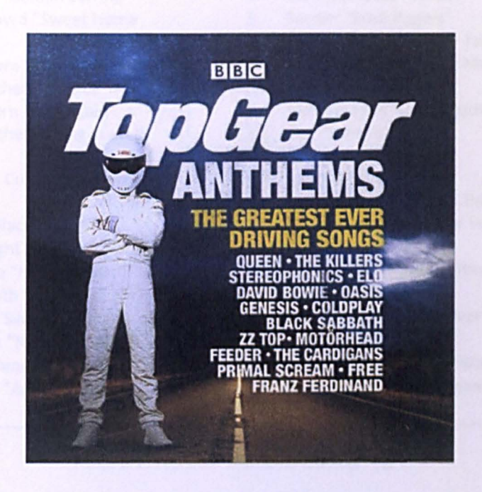
Figure 3.1. Artwork for Top Gear Anthems.

followed by The Killers—classic followed by current. Thus, without even listening to the music itself, its intended function or use and therefore its target market is apparent.