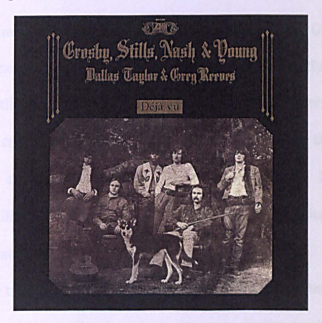
Figure 3.3. Artwork for Crosby, Stills, Nash & Young's Déjà Vu.