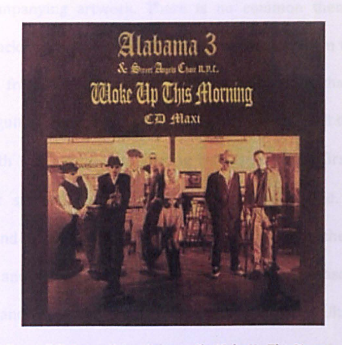
Figure 3.2. Artwork for Alabama 3's Woke Up This Morning.

inclusion of Alabama 3's Woke Up This Morning appears to be based on the artwork for that song's single release paying apparent homage to the Crosby, Stills, Nash & Young album Déjà Vu (see Figure 3.2 and Figure 3.3), an album which also features recordings of two songs by Buffalo Springfield.<sup>81</sup>