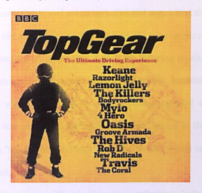
Figure 3.4. Artwork for Top Gear: The Ultimate Driving Experience.

open-road implications of the first release replaced with a more banal implementation of Top Gear branding in the form of the logos of the programme and its broadcaster and The Stig (reduced to almost-silhouette form) against a yellow gridded background (see Figure 3.4).