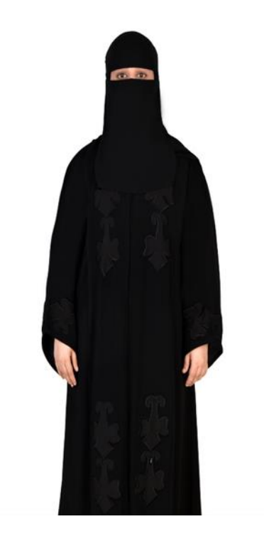
Figure 10 Shoulder abaya and opened niqab.

exposes the eyes of women totally (see figure 10). However, six of them wore a type of hijab that is considered more modest, as it covers more parts of the women's bodies. The abaya starts from the shoulder, as with the previous shape, but replaces the short tarrha with a long one and opens the nigab with an arak wla trany niqab. The long tarrha is a wide scarf that covers the chests and backs of women. The arak wla trany niqab allows a woman to see, but others cannot see her eyes clearly (see figure 11). These types of hijabs were the most popular among the female participants. However, the head abaya has been replaced with a shoulder abaya, and full coverage of the face and hands has been replaced with partial coverage. Thus, I would consider