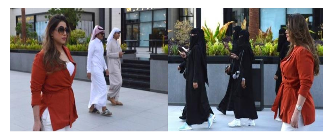
Figure 17. Saudi woman walks through a mall without hijab.

All participants in this research noticed the changes in women's hijab recently. Such changes were noticed by presenting the government for some royal ladies (e.g., Princess Reema bint Bandar Al Saud, who was appointed ambassador to the United States), as the first women from the House of Saud to officially represent the nation outside its borders, and shared their identity with the public with various forms of clothes. Furthermore, the government uses social media platforms to spread the concept of diversity in women's attire in society by publishing photos of uncovered women walking in Riyadh and Jeddah (see figure 17)<sup>11</sup>.