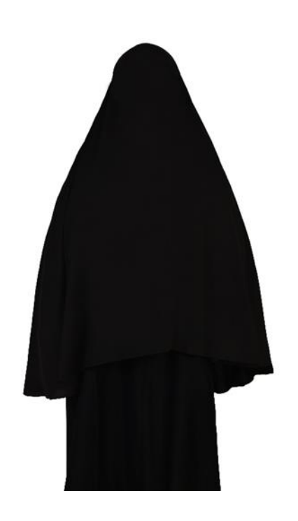
Figure 9 Khimar and kata.

for the eyes. She covers her hands with gloves and feet with socks (see figure 9). Despite these types of hijabs reflecting different levels of modesty, they also reflect the idea that a woman's body is awra and should be entirely covered, including the eyes,