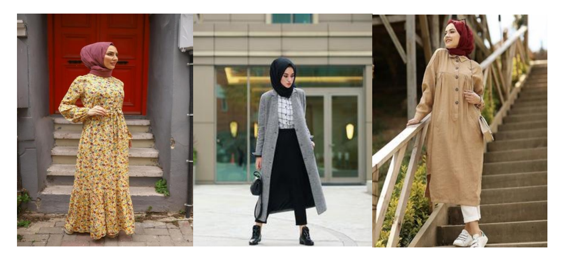
Figure 13 Some pictures of different types of hijab among Muslim women were given to the participants.

Here, Safyh denied considering any clothes of Muslim women except the abaya as Islamic dress or hijab . They agree that the abaya reflects the meaning of hijab in Islam and other kinds of clothes as modesty or just a kind of covering women's bodies. Wearing different forms of the hijab rather than the abaya turns out to be fitnah and a source of temptation, rather than veiling women's charm within society. 'In my society, it is a sin', stated Abu–Mohsen (male, 44 years old) about the various types of hijabs outside Saudi society. He suggests that various shapes of Muslim women's hijab are considered a hijab in other societies, but not in Saudi. He expresses his dissatisfaction with such hijab , as they are considered sins in Saudi society. He justified his argument by saying any shape of the hijab except the abaya grabs the attention of people, which contradicts the idea of the hijab distracting people from looking at women.