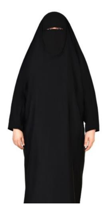
Figure 7. Head abaya and arak wla trany niqab.

Out of the twenty-three women I interviewed, five from different ages, locations