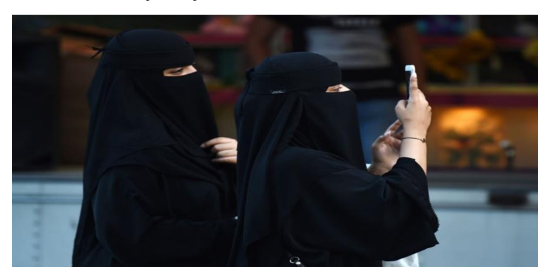
Figure 5. Saudi women were compelled to veil themselves in black and conceal their faces.

Some Sahwa leaders have used this Hadith to argue that the hijab must be black. However, some scholars interpret the mention of 'crows' in this Hadith to refer to the time of day that the women left to pray: early in the morning, while it was still dark. In this case, this word does not mean that women should wear black or another dark colour (Shimek, 2012). Al-Khamis (2014) indicates that the black hijab was not originally the product of Islam or Saudi society and culture. It is speculated to be a result of Turkish influence during the Ottoman Empire, whose leaders covered their harems in black in the public sphere.