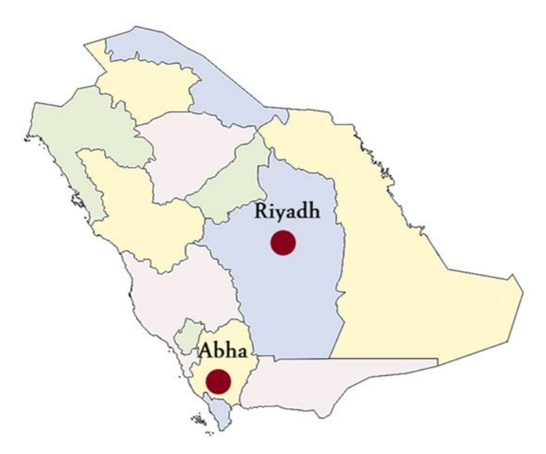
Figure 6. Map of Saudi Arabia showing the location of Riyadh and Abha cities.

Riyadh is the capital of Saudi Arabia and lies in the northeastern part of the Najd region—the heart of Saudi Arabia. It is located in a desert land and has a dry and hot climate (Bogari, 2002). It is considered to be the largest city in Saudi Arabia in both size and population. It is the seat of government, ministries and embassies. It also contains various educational, financial, medical, and commercial organisations, which have led it to become the most modern and developed city in the state. Due to that, citizens from different areas, backgrounds, tribes, and cultures in the state are attracted to it (The United Nations Human Settlements Programme, 2016). Thus, Riyadh holds many of the subcultures of the kingdom and has diverse customs and traditions of various backgrounds (Al-Dossry, 2012). Also, based on my observations regarding changes related to female appearance, various types of hijab are in use in Riyadh, from extreme to liberal shapes; thus, it seemed to be an appropriate site for conducting this research.