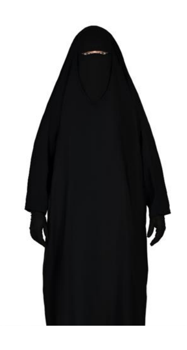
Figure 8 Head abaya and arak wla trany niqab and gloves.

eyes for them to see. Their hands are exposed as they cover them with abaya sleeves except for one woman from Abha city who wore gloves to cover her hands (see figure 8). One woman who was also from Abha added some details to her hijab , which made it a more modest one than those of the other four women, which included the khimar and kata . This type of hijab includes a shoulder abaya and short tarrha and khimar , which starts from overhead and goes down below the knees. Kata refers to covering the whole face, including eyes, which differs from niqab , which allows a woman to see through a slit