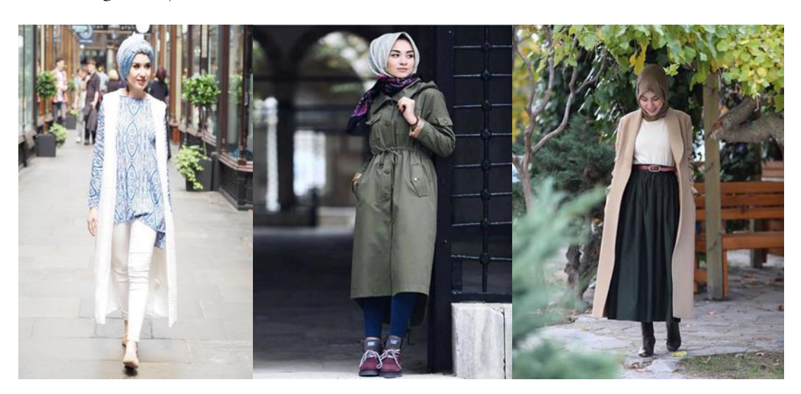
Figure 2. Some different types of fashionable hijab among Muslim women

women who view religious values as important show little interest in the fashionable hijab because they feel the hijab should not be attention-grabbing or tight-fitting. These women fear that the media portrayal of the hijab as a fashion item has diluted its meaning as an Islamic symbol that protects women's modesty (Albrecht, 2012; Zainal and Wong, 2017).