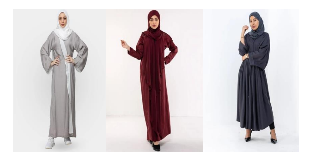
Figure 15 Coloured tarrha and abaya.

Like Marifatullah's (2018) study, black is seen as the appropriate colour for the hijab for all participants regardless of their diversity. Dark colours also seem to be warmly accepted by two female participants as they see those to be closer to black and do not grab attention as much as bright and loud colours. Thus, women and men were clearly positive about the black colour, which contradicts DeCoursey's (2017) study, which expressed the negativity of Saudi women about the black and dark colour of the abaya . The participants confirmed that the hijab could not be the ideal Islamic hijab if its colour was not black, as some women wore black for religious reasons. Due to its darkness, the black colour does not outline a woman's body and