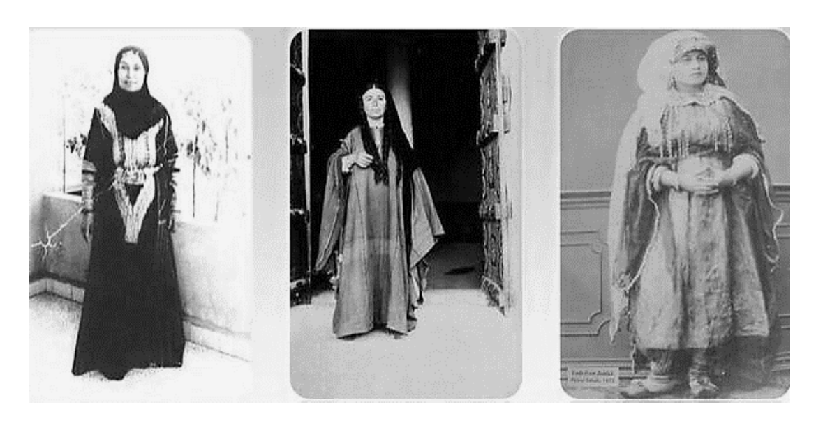
Figure 4. Examples of some Saudi traditional dress styles for women in three regions, from left to right: south, north and west.

covering became the acceptable religious form of female clothing, which also permeated Saudi culture, as uniform full covering clothes are consistent with the cultural values of chastity and sexual modesty (Al-Tuwayjiri, 2018).