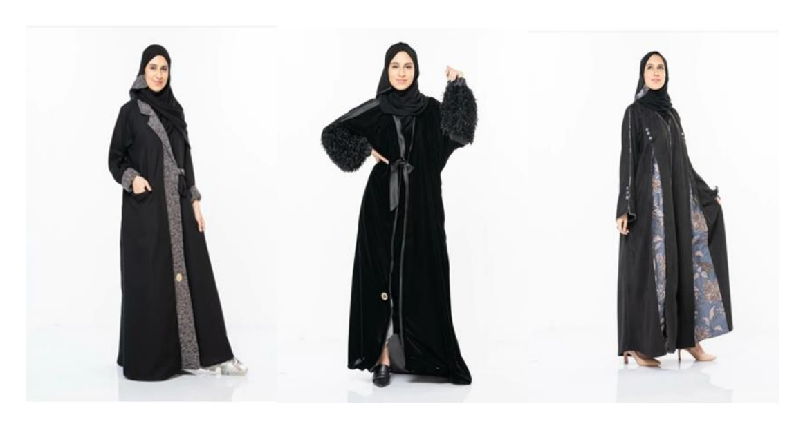
Figure 14. Stylish and trendy black abaya.

colour, decoration, tightness, buckles, buttons, and embroidery (see figure 14)8. They believe that if an abaya contains such things, it cannot be regarded as a hijab and it is considered deviating from norms existing in society. Any small changes to the image of abaya as plain, black and loose are regarded as a violation of the hijab norms. Abu—Mohsen (male, 44 years old) shows no admiration for abaya that is tight, decorated and has buttons and buckles. 'I do not like its colours, tightness, shape, buttons, and pockets as they call the attention of people. I do not accept that my wife wears it'. He justified his opinion that such abaya grabs people's attention and expresses a woman's beauty, which conflicts with the conditions of the hijab in Islam. Sumiah (female, 21 years old) agrees with Abu–Mohsen's argument and regards wearing abaya with belt as violating the rules of hijab that state that a hijab must be loose and does not disclose the shape of a woman's body.