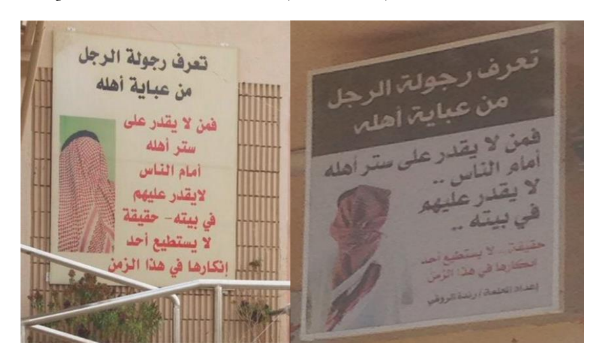
Figure 16. 'The man can be known by his women abaya, and who cannot cover her in front of people, cannot control her at home...'. A saying was written on girls' schools wall for years, which associates manhood with authority over women's hijab.