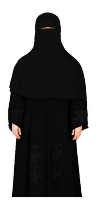
Figure 11 Shoulder abaya, long tarrha and arak wla trany niqab.

One female participant, the youngest participant in this research, wore a shoulder