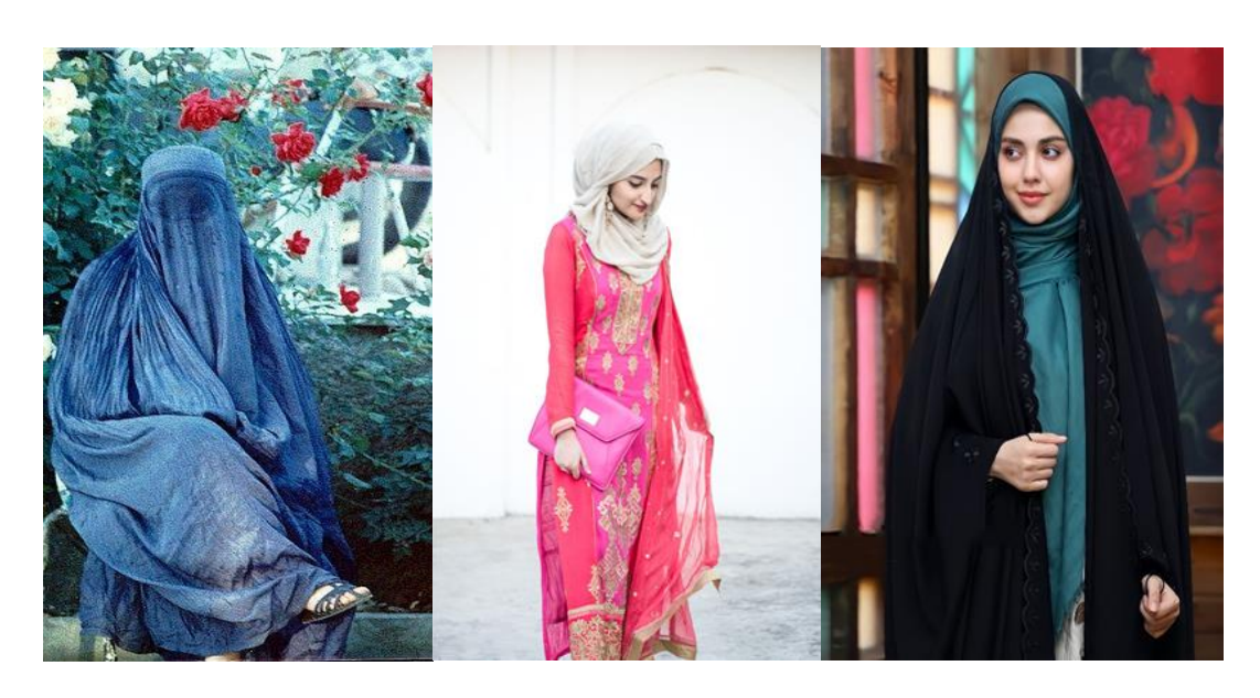
Figure 1. Various types of hijab are worn in Muslim world

above it. It covers the hair, ears, and shoulders but exposes the face. Al-Amira is another form of hijab made of two pieces: one is close-fitting covering the hair and ears but leaving the face showing, and this is covered by another scarf (Ahmad, 2011). Bandanna is a form of hijab that is used to partly cover the hair, but it leaves the ears and neck uncovered. This is generally worn by those living in rural areas or by modern young Muslim women, because it makes them look more beautiful than other types of hijab , enabling them to have a career, get married, and enjoy life (Al-Kateeb, 2013).