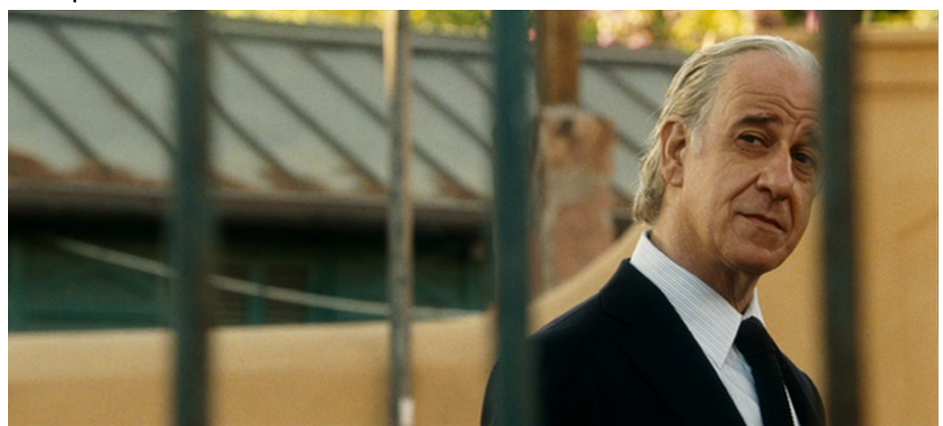
Figure 15. Suturing Rome through Jep's perspective in The Great Beauty: cutting back to Jep's appreciative look In the first shot, the camera is mobile, matching the speed of Jep's walk (presented seconds before). It thus already gives a sense that the scene is being viewed from the protagonist's perspective. This is then confirmed when the camera cuts back to Jep (fig. 13). At this point, the camera moves in to register Jep's look of awe, and then cuts back to an artistically framed shot of the scene (fig. 14). In this shot, the image is symmetrical, there is an aesthetically-pleasing interplay of colours – the orange and green, combined with an intriguing image of a truncated nun. The content of the shot itself suggests that Jep might be its origin within the diegesis, since its stylisation suggests an artistic vision over the scene (a