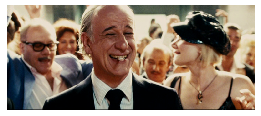
Figure 10. Distinguishing Jep as an artist in The Great Beauty: slow reveal of Jep's debauched smile

However, while Lorena could be said to remain a symbol of feminised degradation, Jep is elevated to the status of artist. 70 While the rest of the partygoers are dancing 'La Colita', the film slows down, the music becomes muted, and Jep steps out from the crowd to address the audience. The figure we just saw is suspended and a distinct one emerges. Not only is he physically separated from the others, he appears to occupy another plane, temporally different – he moves in normal time while the others are frozen – he is also given a different