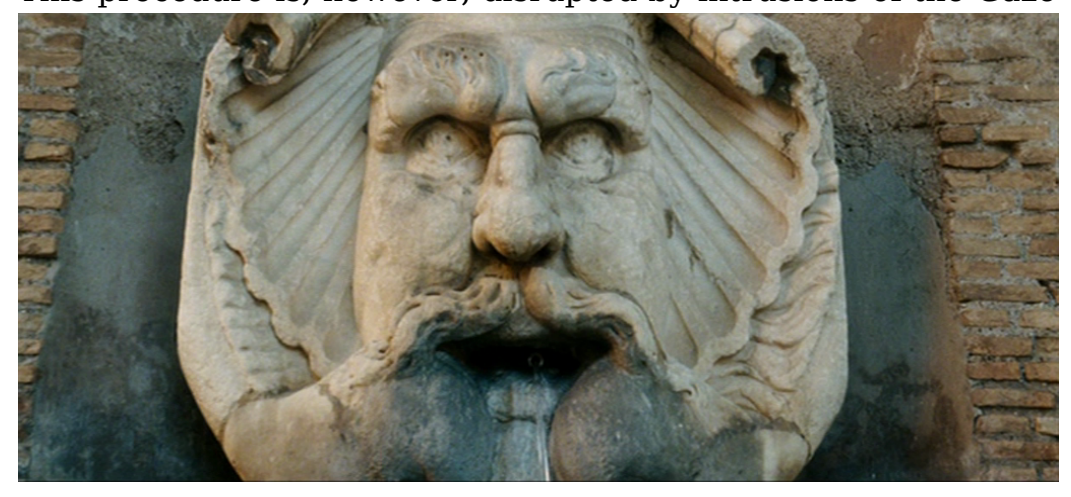
Figure 16. First cases of uncanny object and impossible POV shot in The Great Beauty: the grotesque fountain

This procedure is, however, disrupted by intrusions of the Gaze