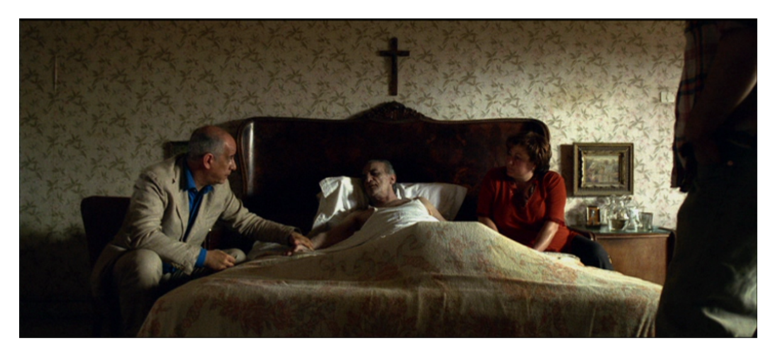
Figure 25. Gomorrah screens the abjection of the South: poisoned man lays dying in bed

of the South as an effect of global capitalism's displacement of its excesses onto the region. Gomorrah shows the manifestation of these effects through the figure of a dying father whose family, having had their land and their bodies contaminated by toxic waste, plead for yet more to be dumped near them. If the abject can be understood as 'death infecting life', the man's poisoned body makes the abject waste visible – capitalism's toxic excess, death, infecting the Neapolitan people's lives (Kristeva, 1982, 4).