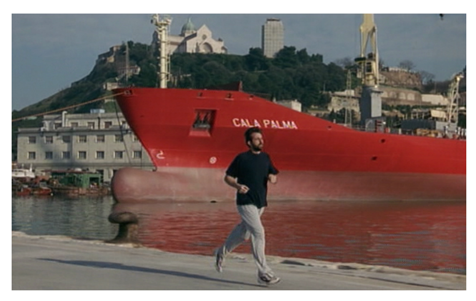
Figure 1. The body of the auteur: Morettian figure runs along the port of Ancona in the opening of The Son's Room

Building on De Geatano's (1999) theory of Moretti's grotesque acting style, I argue that one of the most inescapable, and contradictory, aspects of Moretti's films is the actor-auteur's physical embodiment on screen. Furthermore, the auteur's effigy represents the authorial signature par excellence , the indelible stain of the auteur on his work. The first shot of The