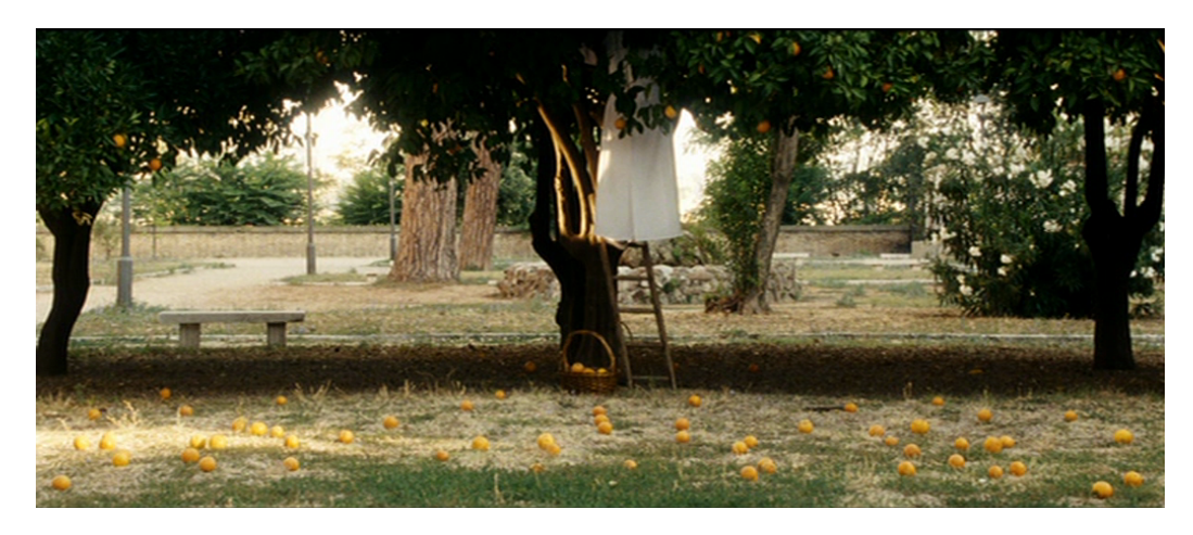
Figure 14. Suturing Rome through Jep's perspective in The Great Beauty: second shot of convent garden, artistically composed