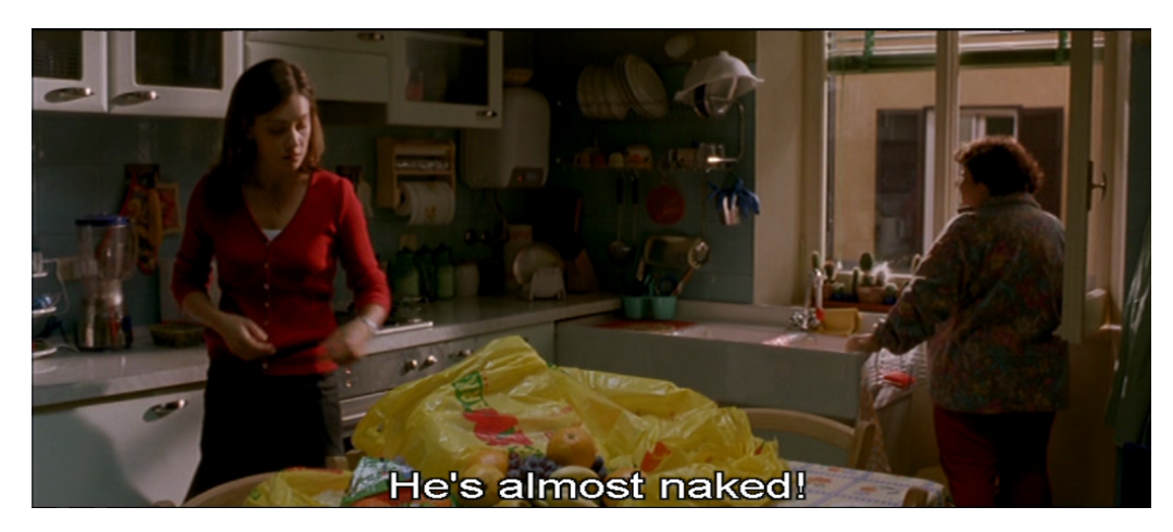
Figure 3. Screening desire for Lorenzo in Facing Window: Eminè watches him getting undressed through the window/screen

Initially, Facing Window appears to depict Giovanna's desire for Lorenzo in a way that supports both the synopsis's and Marcus's description of it. Indeed, as Marcus (2007, 148-49) argues, the casting of Bova, an Italian 'heartthrob' known for his roles in romantic comedies, not only characterises Lorenzo as a love object for Giovanna, but also indicates the metacinematic dimension of the film's illustration of the protagonist's, and audience's, desire. The film's emphasis on voyeurism and technique of 'screening' Lorenzo through