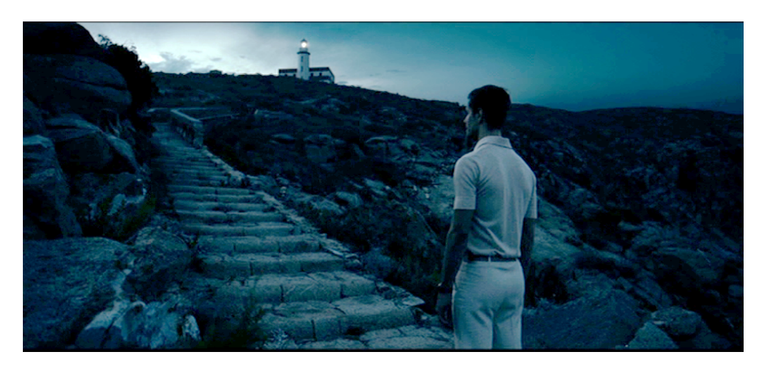
Figure 18. Second case of uncanny object in The Great Beauty: a lighthouse looms over Jep, Elisa, and the denouement