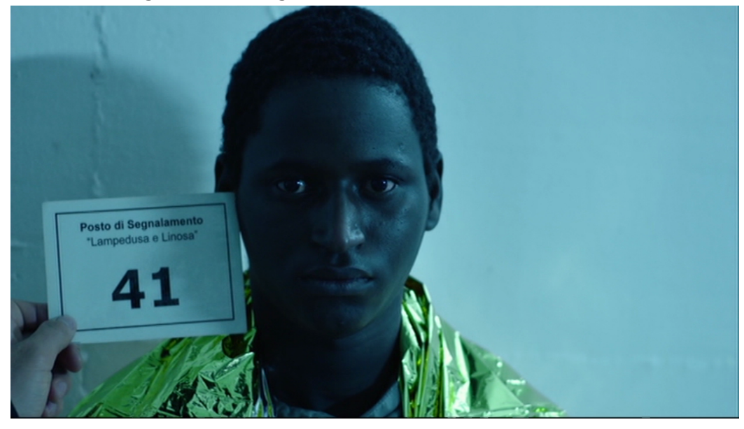
Figure 24. Screening the Gaze in Fire at Sea: number clashes with refugee's face as he is photographed