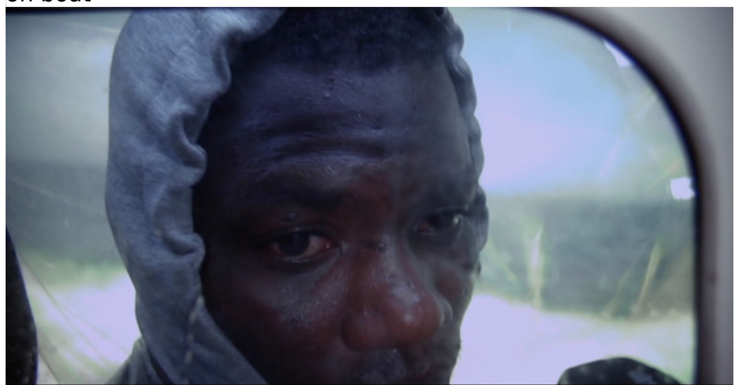
Figure 23. Screening the Gaze in Fire at Sea: window frame around refugee suffering on boat