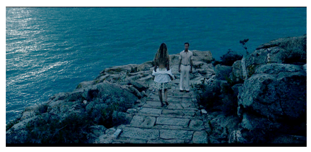
Figure 17. Second case of impossible POV shot in The Great Beauty: disrupting Jep and Elisa's romantic union

The camera is positioned slightly up the path towards the lighthouse, appearing to capture the scene from the perspective of the rocks on which the lighthouse is built. As well as disrupting the shot reverse shot sequence with the