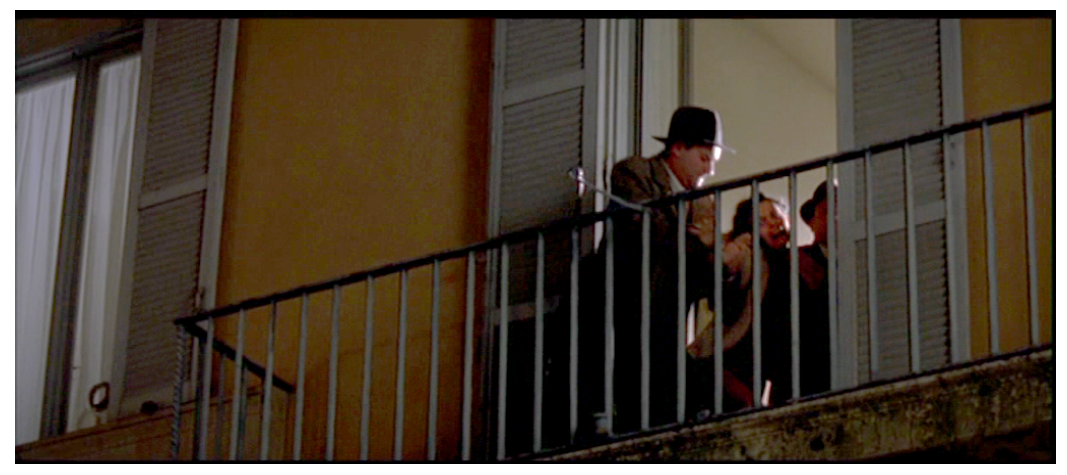
Figure 9. Davide's hallucinations in Facing Window: a Nazi raid in present-day Rome

Holocaust memory, discussed above (Marcus, 2007, 143).<sup>49</sup> Davide's being out of place in the present does not only produce a sense of rupture in the social order as such - the