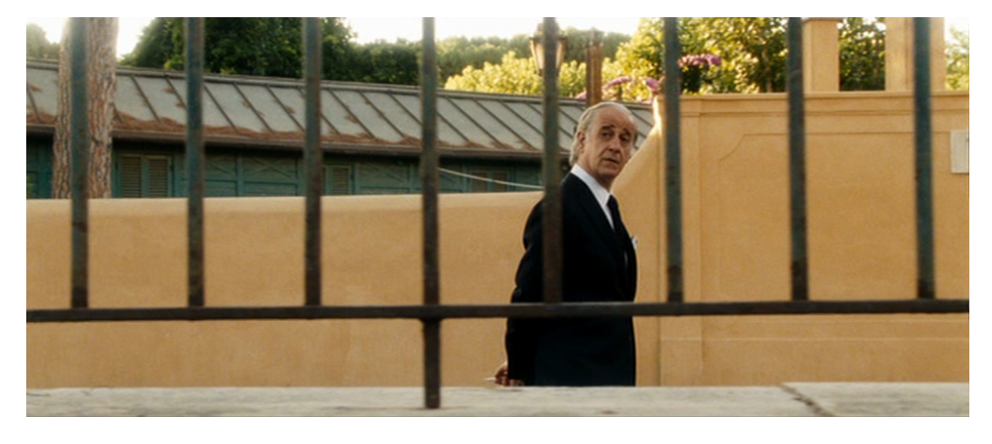
Figure 13. Suturing Rome through Jep's perspective in The Great Beauty: first cut back to Jep