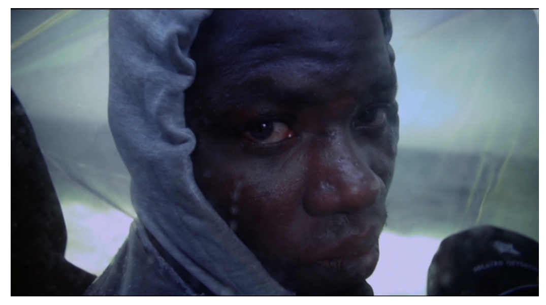
Figure 22. Screening the Gaze in Fire at Sea: suffering refugee on boat