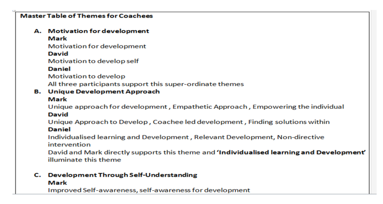
Figure 3.5 Cross Analysis

Looking for patterns across cases – The cross-analysis of cases was undertaken after the individual case analysis. I searched for possible combinations across cases by exploring themes that complement each other, and also for the most powerful themes in terms of representation, and those that answer the research question (see figure 3.5).