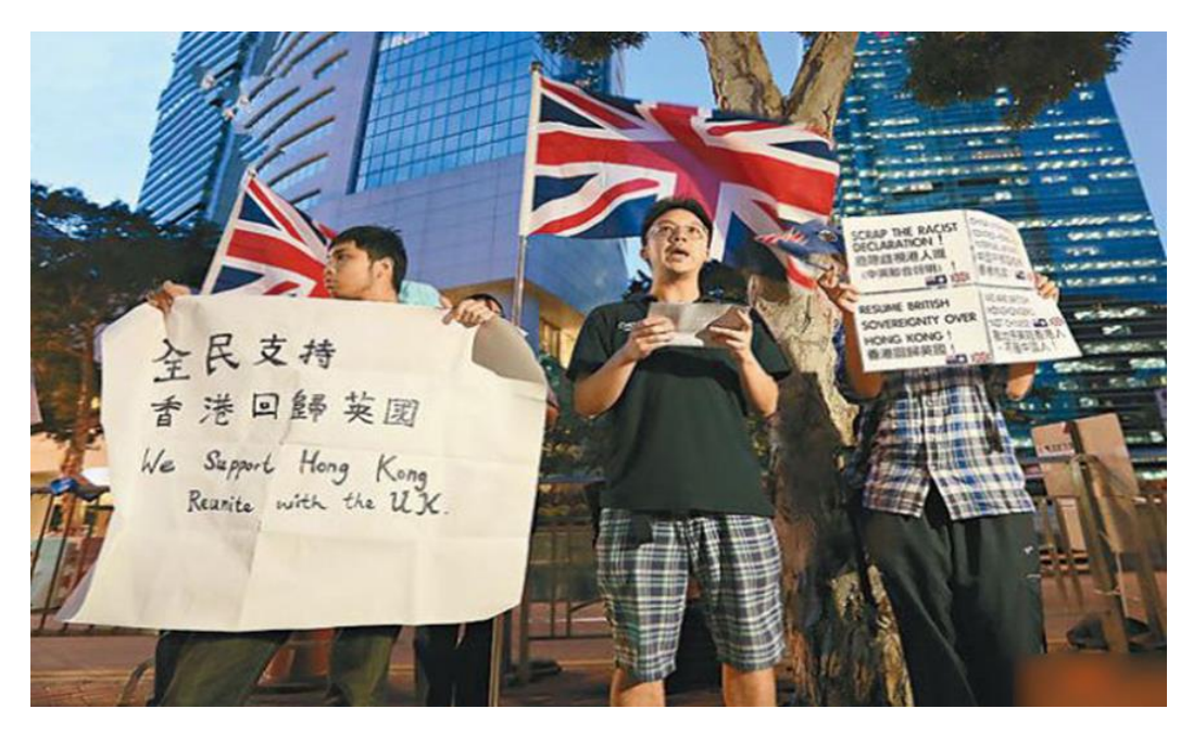
Figure 5.2 Deconstruction of the "Occupy Central" event: late 2014 the "Umbrella Revolution" 'activists' openly called for a historical regression with Hong Kong 'rejoining' Britain under the Nanjing Treaty