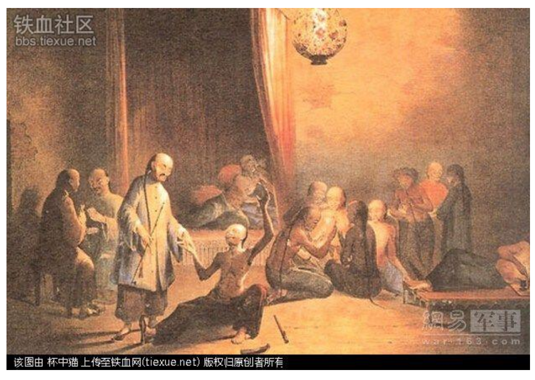
Figure 6.3 Chinese were portrayed as 'opium addictive' and physically and intellectually 'inferior'

'Yellow Peril'. During the turn of the 20<sup>th</sup> century and at the height of the 'Yellow Peril' discourse, the Chinese were portrayed as "by nature physically and intellectually inferior, morally suspect, heathen, licentious, disease-driven, feral, violent, uncivilised, infantile" (Marchetti, 1993, p.3), "opium and gambling addictive" and a potential threat to the white people (MacDonald, 1974, p.543).