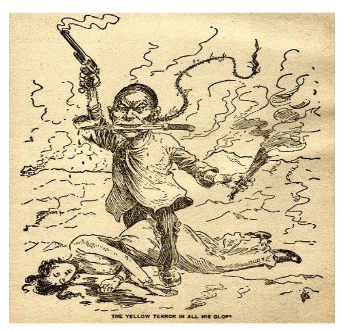
Figure 6.4 'Yellow Peril' Poster: "The Yellow Terror in all his Glory", 1899