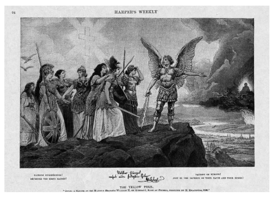
Figure 6.1 "Peoples of Europe, Defend your Holiest Possessions" by Hermann Knackfuss

Fu Manchu is constructed as a 'sinister', 'evil', and 'aggressive' embodiment of the 'Yellow Peril', and thus completely different to the fictional 'heroes' of the 'civilised' West (Western civilisation is epitomised, for example, by Dr Livingstone, as an intrepid individual braving the wilds of Africa on his mission to bring European 'civilisation' to the benighted "dark continent"). Chan (2001, p.16) critically analyses the image of Fu Manchu, and points out that "Western male supremacy, as an ideological construct, is re-established as Asian men are ritualistically vilified in order to maintain a sense of superiority among white men". In other words, the denigration of the non-Western nations in general, and Asian nations in particular, serves to strengthen the self-image of the West as superior.