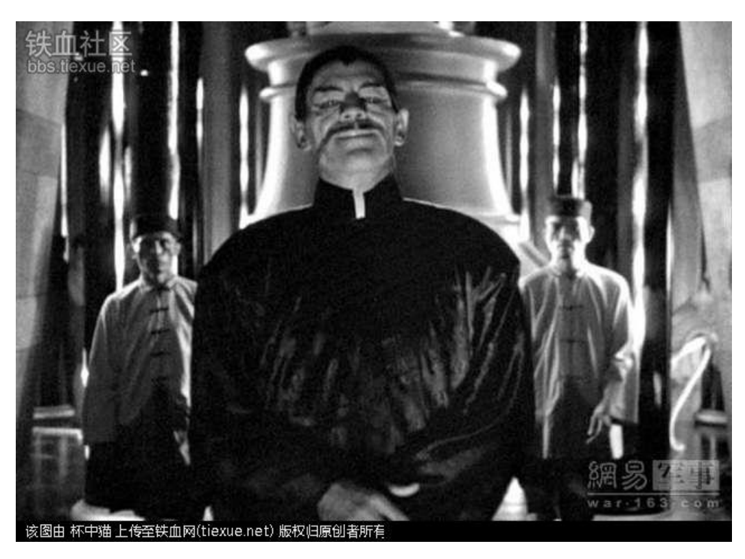
Figure 6.2 The image of Fu Manchu

Home!' The painting evoked the need for an Occidental alliance against the threat to Christian civilisation supposedly posed by the rising races of the Orient. It was this painting that called onto centre stage the present era's stereotypes with the 'Yellow Peril'". Source: (Tchen and Yeats, 2014.)