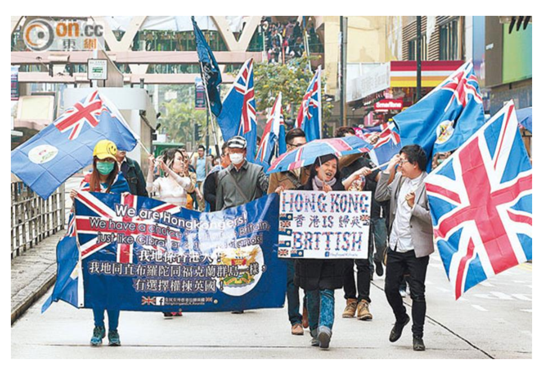
Figure 5.1 Deconstruction of the "Occupy Central" event: late 2014 the "Umbrella Revolution" participant openly waved the Empire flag seeking backup from the colonial/neo-colonial powers