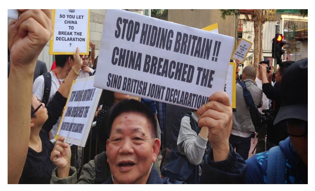
Figure 5.3 Deconstruction of the "Occupy Central" event: organisers visited the British Consulate General in Hong Kong seeking backup from the former colonial power