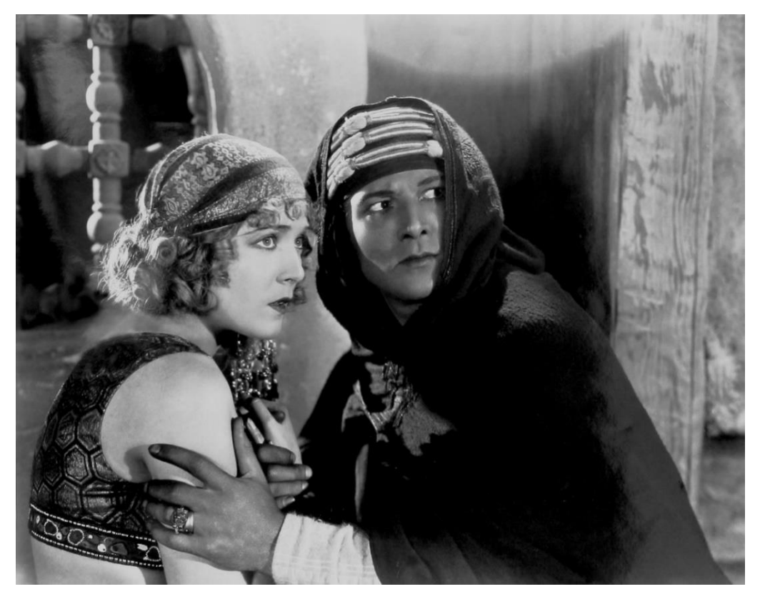
Figure 19. Whiteness made visible through juxtaposition with the racial other. Bánky and Valentino in The Son of the Sheik (1926).

In the film's rape-seduction scene, Ahmed moves towards his victim, emerging from the shadows, as she moves back in fear. The arrangement of light and dark, transparency and substance, full blown sexuality and sexual indifference,<sup>42</sup> is used to bring Yasmin's delicate, white femininity to the forefront (Figure 19). Her facial features are framed here by the soft, diffused lighting that minimises the irregularities of surfaces, making her skin appear naturally smooth and radiant. As theorised by Kobal, 'the balance of light and shade is crucial in dramatizing and conferring an atmosphere of sexual allure on the [film's] subjects.'<sup>43</sup>