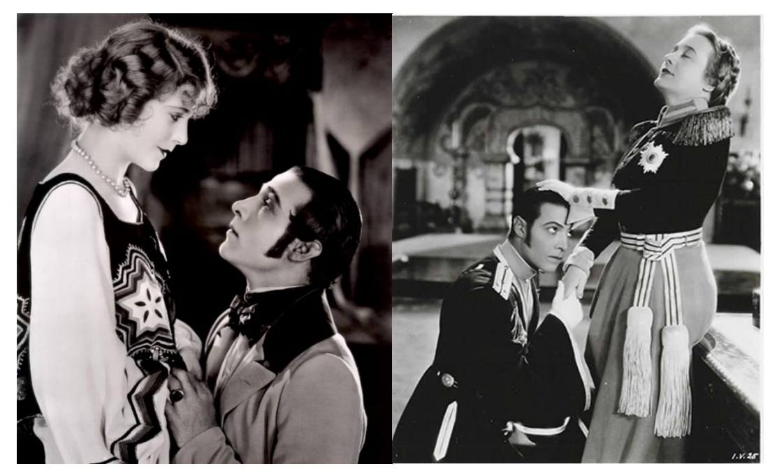
Figure 16. Seducer and seduced: Valentino as Dubrovsky with Masha (left) and Catherine the Great (right).

whilst the former wears delicate gowns and elaborate Russian dress, the latter is seen mostly in military uniform (Figure 16).