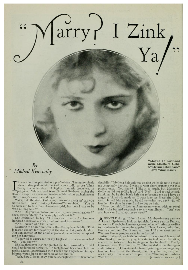
Figure 13. In April 1927, Photoplay used misspellings to signal Bánky's strong, foreign accent.

her figure with a lack of agency, which effectively rendered Bánky a safe, troublefree version of immigrant womanhood. In the words of one columnist, Bánky's accent was 'captivating and her good-natured distress at being unable to say what she wants to say is quite enchanting.'<sup>33</sup> This specific treatment stressing childlike innocence was, to an extent, paralleled in the publicity produced for one of the greatest stars to appear on the silent screen: Mary Pickford. Although Pickford's 'on and off-screen masquerade of childishness'<sup>34</sup> was developed much further than Bánky's, this facet of her persona functioned on similar terms; to downplay her independence as both a woman and a creative professional.