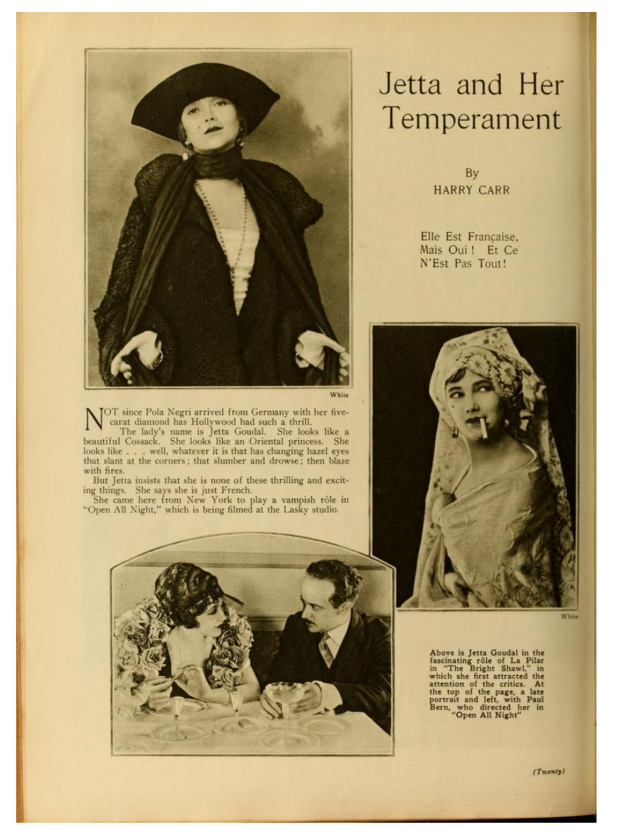
Figure 35. 'Jetta and Her Temperament', published by Motion Picture Classic in October 1924.

director a sidelong glance and a queer little twisted smile and says sweetly: Ah, no. Goudal wouldn't do that. And a herd of cyclones can't make Goudal do it.'<sup>23</sup>