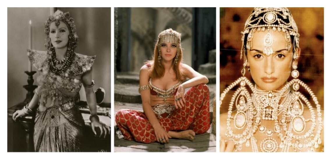
Figure 38. White actresses in exotic costumes: Greta Garbo as Mata Hari (1931), Anna Karina in the 1970s and Penélope Cruz wearing Christian Dior in late 1990s.

Decades after Negri and Goudal descended from the Hollywood pantheon, many visual tropes deployed in their images, especially those that bespeak of exoticism, remain in use. Glamour photographs continue to appropriate costumes and makeup that position their wearers as semi-exotic subjects: that is, as white women carrying the spectre of Oriental thrills.