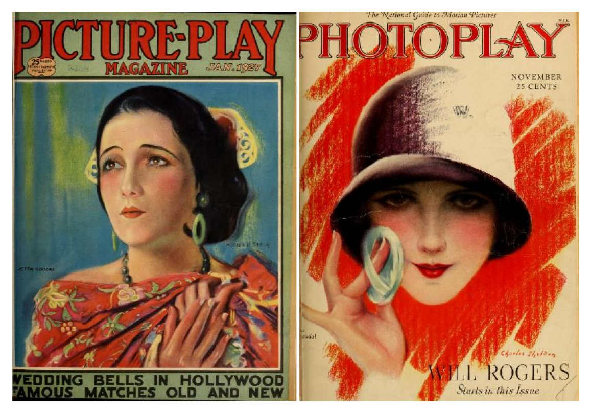
Figure 33. Exotic 'other' or the modern new woman? Two magazine covers present strikingly different versions of Goudal. Picture Play , January 1927 and Photoplay , November of the same year.

Goudal, a French actress, was a new thrill in Hollywood.<sup>39</sup> The interview conducted by Motion Picture Classic stays in line with that simulacrum, revealing that Goudal is 'just French.'<sup>40</sup> She might look like an oriental princess, but regardless of the rumours, she does not have a drop of Indian or Mongolian blood running through her veins.