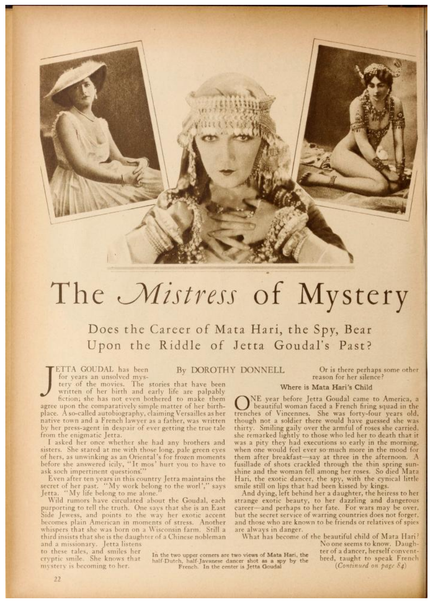
Figure 34. Article from Motion Picture Classic arguing that Goudal might be a lost daughter of Mata Hari, the infamous spy.

paradigm.<sup>56</sup> Most importantly, the peculiar placement of Hari, the symbol, somewhere between the Orient and Occident, made her concomitant with Goudal's public narrative.