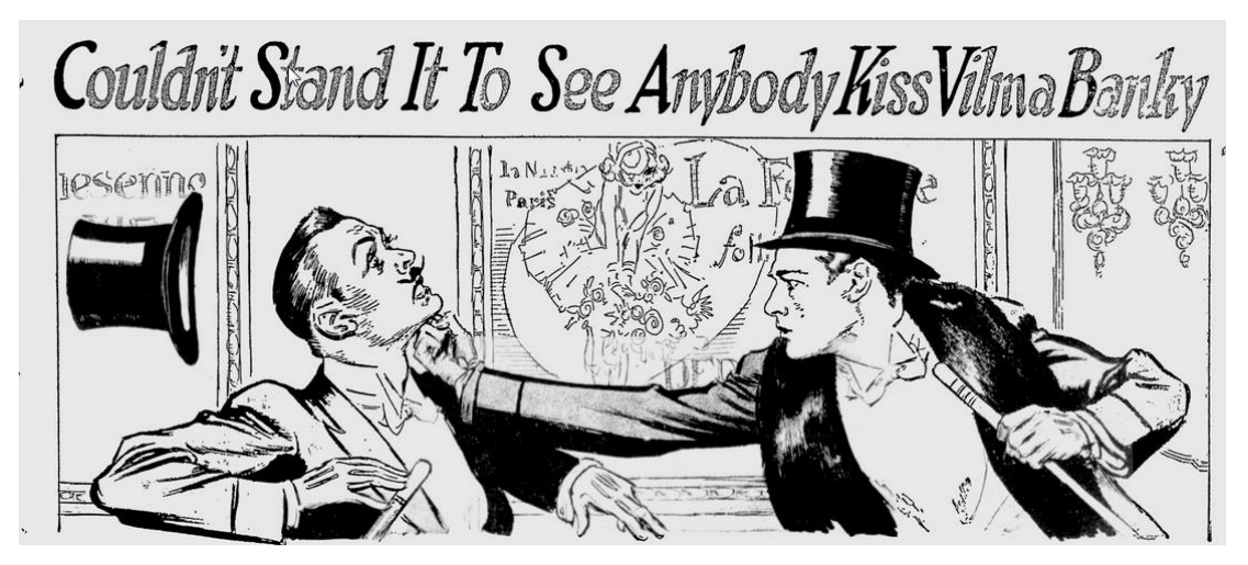
Figure 18. Valentino's and Lukatz's confrontation, as imagined by the illustrator of Pittsburgh Press.

accompanying photos (Figure 17).<sup>34</sup> Such uniformity confirms the status of the Valentino/ Lukatz affair as a promotional endeavour arranged and circulated by the studio officials.