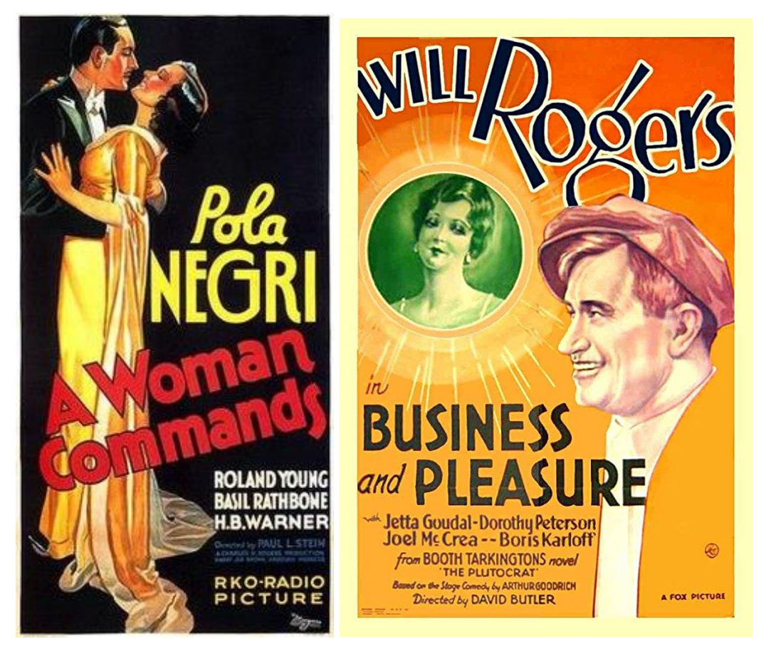
Figure 37. Posters for 'A Woman Commands' (1932) and 'Business and Pleasure' (1932); films among the last screen appearnces of Negri and Goudal respectively.

'Pola Negri returns from royal retreat more than ever la femme fatale of filmdom',<sup>1</sup> announced a review of A Woman Commands (1932), Negri's first American talking picture. Yet, the star's return to the screen failed to attract movie-goers as much as the producers had hoped; recording a loss of $265,000,<sup>2</sup> the film became one of Negri's last Hollywood appearances.<sup>3</sup>