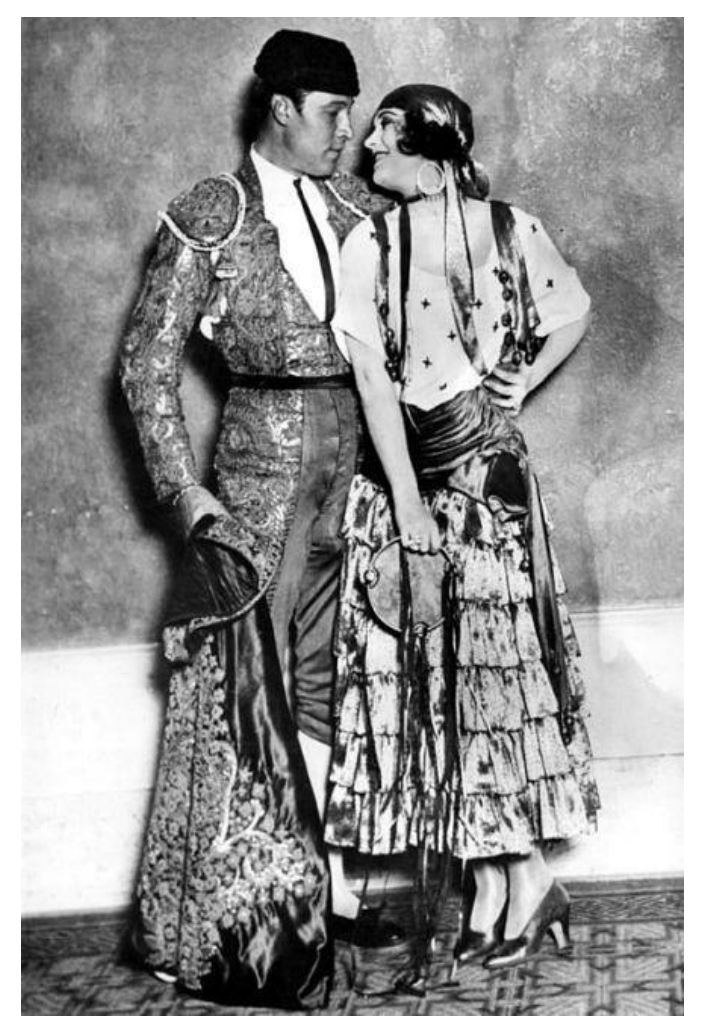
Figure 9. Negri and Valentino wearing Spanish costumes at The Sixty Club.