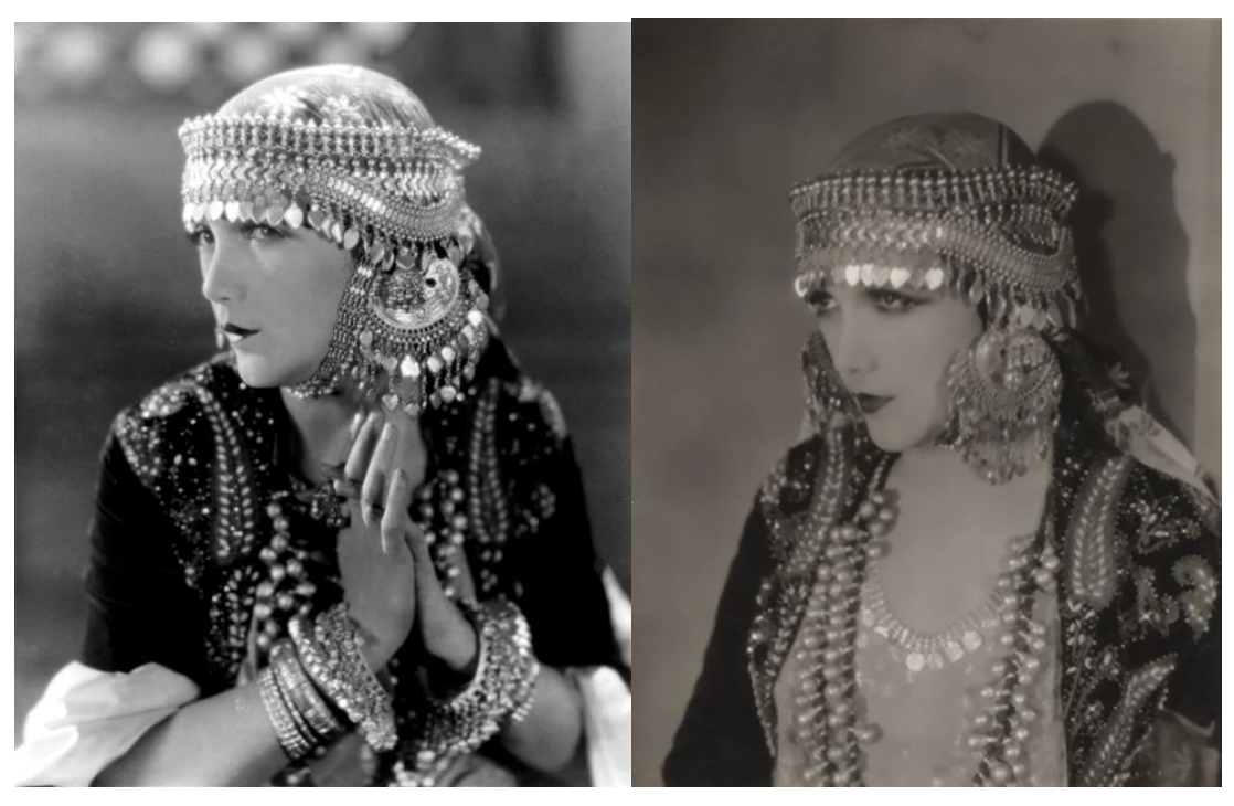
Figure 29. Goudal in publicity stills promoting The Forbidden Woman (1927)

In The Forbidden Woman , Goudal portrayed Zita, a Moroccan spy and Sultan's daughter, forced to marry a French colonel to serve her country in obtaining military secrets.<sup>69</sup> On her journey to Paris, Zita meets a famous violinist and, to her despair, becomes entrapped by her romantic feelings for the man who soon turns out to be her brother-in-law. When the colonel catches the lovers red-handed, he sends his brother to Morocco; Zita falls victim to her convoluted circumstances and eventually confesses to treachery.