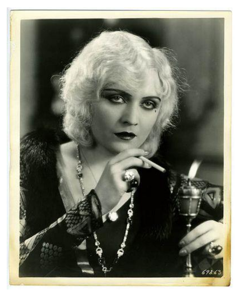
Figure 7. Negri in a publicity still for Three Sinners (1928).

urban centres, and it was not until the late 1920s that it entered the mainstream.<sup>181</sup> In the rural parts of the country conspicuous make-up remained associated with wanton women and continued to be viewed as morally dubious. In her film portrayals, Negri sported a sensual look that relied heavily on cosmetics; with emphasised dark eyelids and carmine lips, she contrasted sharply with the idealised vision of natural female beauty. Furthermore, the constant cultivation of modern beauty practices framed Negri as an excessively produced and self-regulated body, which reinforced her link to seduction, urban landscape and commodification.