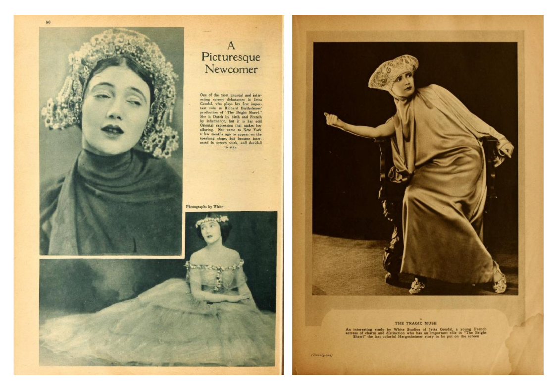
Figure 27. Features advertising Goudal's performance in The Bright Shawl . From the left: Picture Play, July 1923 and Motion Picture Classic, June 1923.

oriental fashions (Figure 27).<sup>52</sup> Indeed, the visual culture of the United States mixed elements of Egyptomania, Japonisme, Chinoiserie and Style Russe, creating an intoxicating style that, in losing its national specificity, denoted little more than opposition to aesthetic traditions of the West.<sup>53</sup>