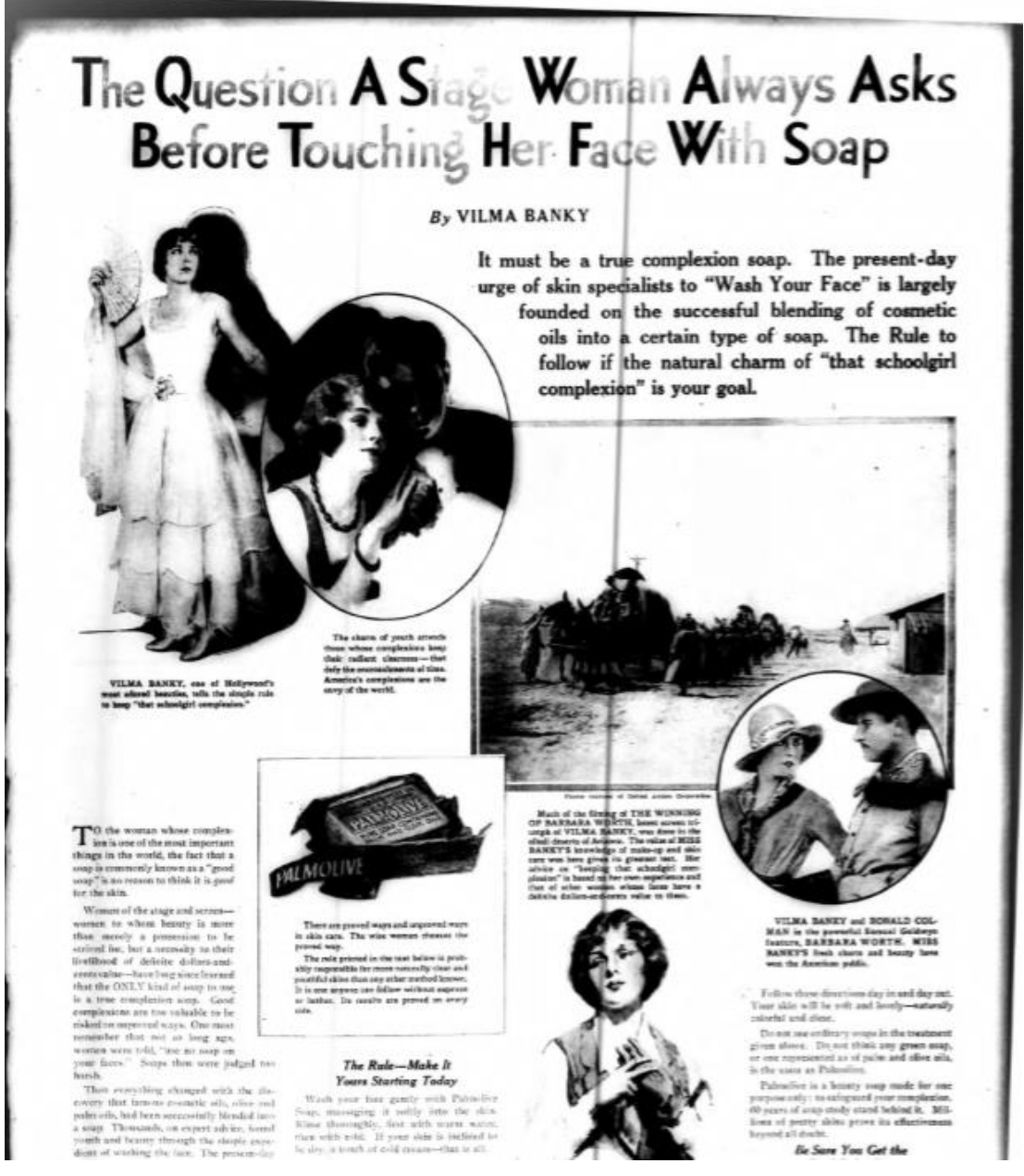
Figure 15. Palmolive soap advert featuring Vilma Bánky from 1927.

complexions are the envy of the world.<sup>'86</sup> As such, the article is careful not to mark Bánky as non-American. What is aesthetically intriguing here is the image of Bánky with a peculiar figure of a man, lit so purely as if to resemble a silhouette. By deploying this contrasting imagery, the visual composition allows whiteness of the star to come to the forefront.