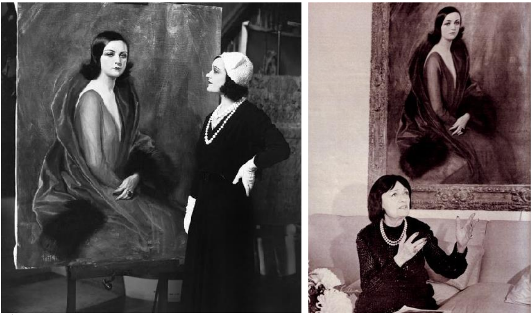
Figure 1. Pola Negri, posing with a portrait of herself, at the height of her career and later in life (approximately 1970s).