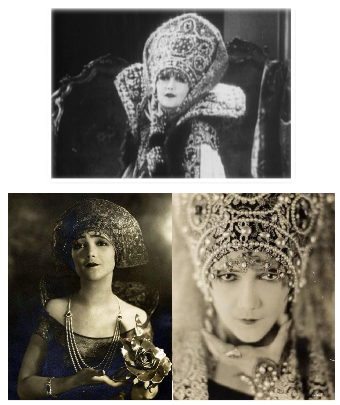
Figure 28. Top: Goudal as Nadia Ramiroff in The Coming of Amos (1927). Below: publicity photos showing the star in a similar headdress.

admirer. Nadia's love for the main protagonist, Amos (Rod La Rocque), is not a scheme devised to obtain social or financial advantage.