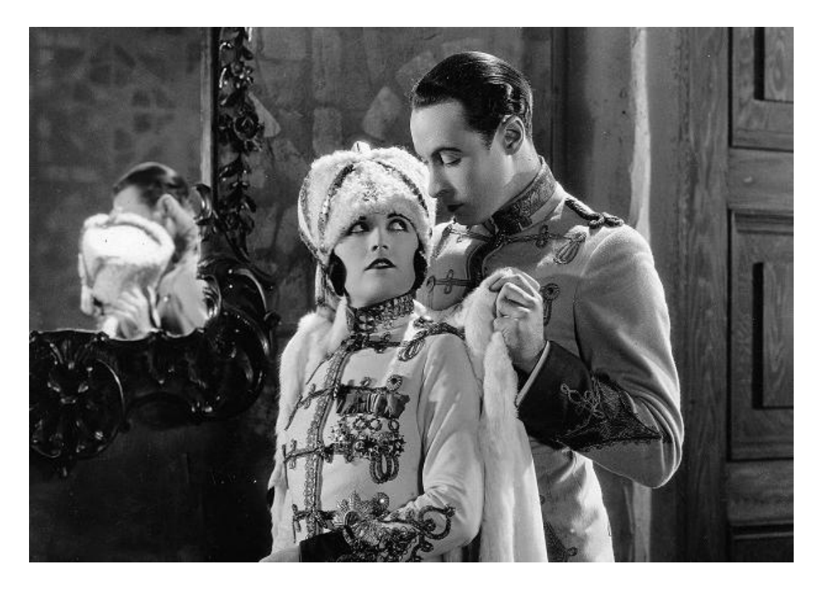
Figure 8. Negri as Czarina and La Rocque as her lover, Alexei Czerny, in Forbidden Paradise (1924).

vessel for reproduction who is unsullied by the dark drives that reproduction entails.<sup>29</sup>