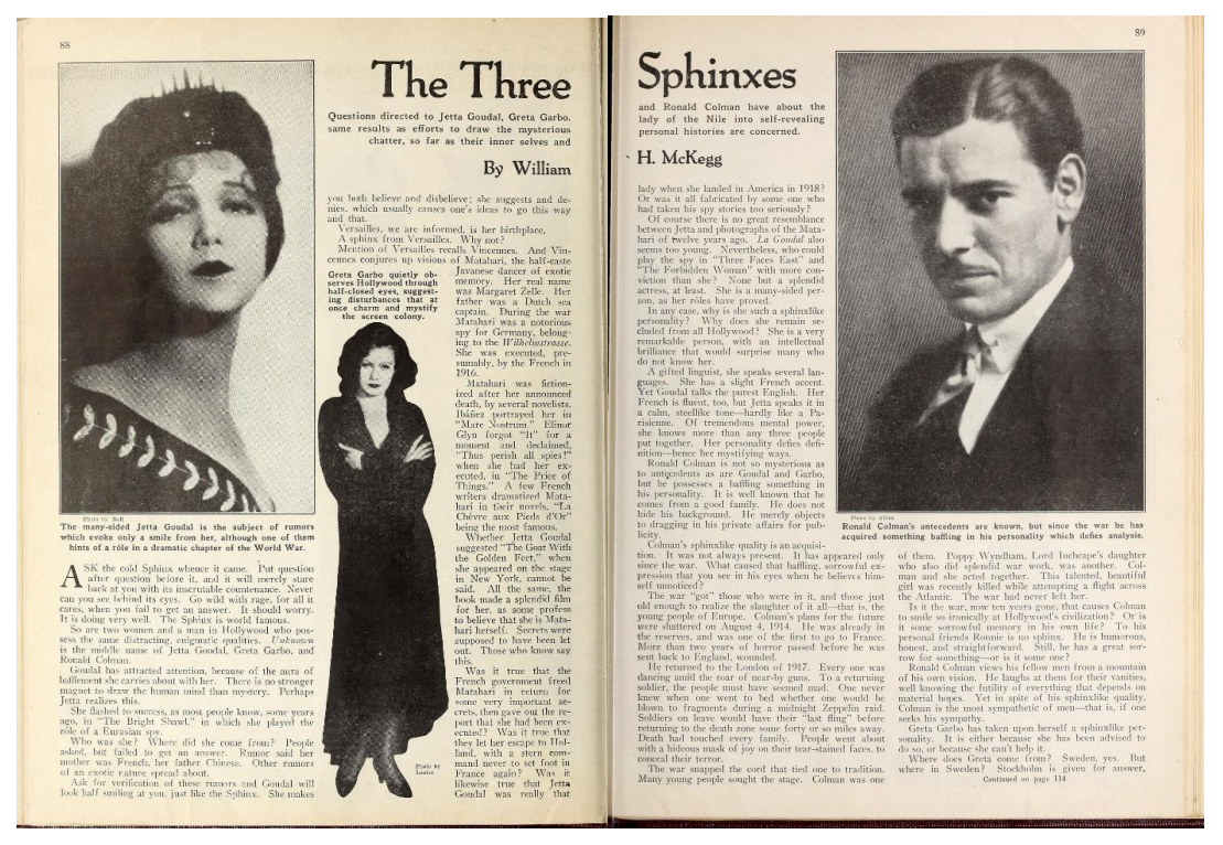
Figure 32 . Goudal, Colman and Garbo were described as enigmatic 'sphinxes' in the July 1929 edition of Picture Play .

which usually causes one's ideas to go this way and that.'<sup>21</sup> The article by Motion Picture Magazine is unusual, as it briefly addresses the role played by studios in constructing star identities. 'Some of the life stories of film celebrities have been made out of white cloth – and colourful cloth – by their publicity men. There was Ricardo Cortez, for instance.' The interviewer goes on to admit he had asked Cortez about his birthplace, to which the actor replied: 'The publicity department hasn't decided that yet'.'<sup>22</sup>