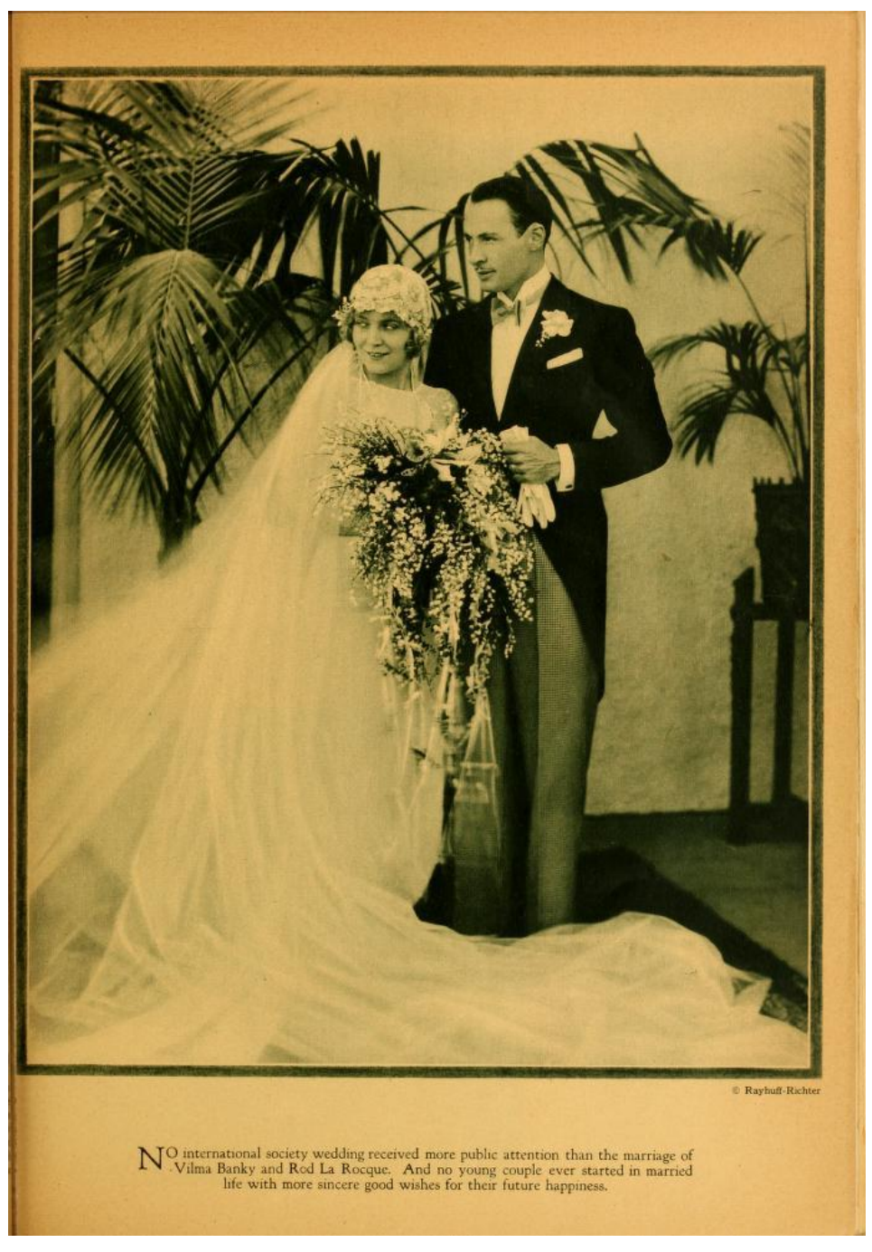
Figure 23. Photograph of the newlyweds from September 1927 issue of Photoplay .

know , Vilma answered. You would have to ask Sam Goldwyn. <sup>'31</sup> This ironic reflectivity reveals the degree to which fan publications were allowed to disclose the inner-workings of the studio system, or even criticise profile-raising efforts as explicitly fabricated practices. The same meditative approach towards practices upheld by the film industry was rarely found in the discursive patterns of unspecialised, local and national papers.