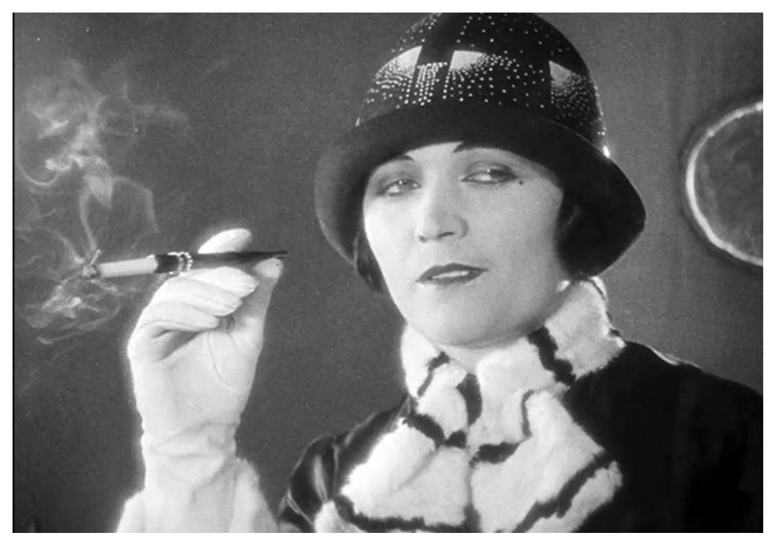
Figure 12. As Italian Countess Elnora Natatorini in The Woman of the World (1925).

and satin, Elnora connotes a sense of bohemia and sophistication at odds with her new surroundings. In one of the early scenes, she scandalises the district attorney to the point where she is asked to leave Maple Valley. 'We don't want loose women from other towns here – (...) and I'll give you twenty minutes to get back from where you came.' 'Pardon, Monsieur', replies the woman with her trademark nonchalance, 'you allow so little time – I come from Italy.'