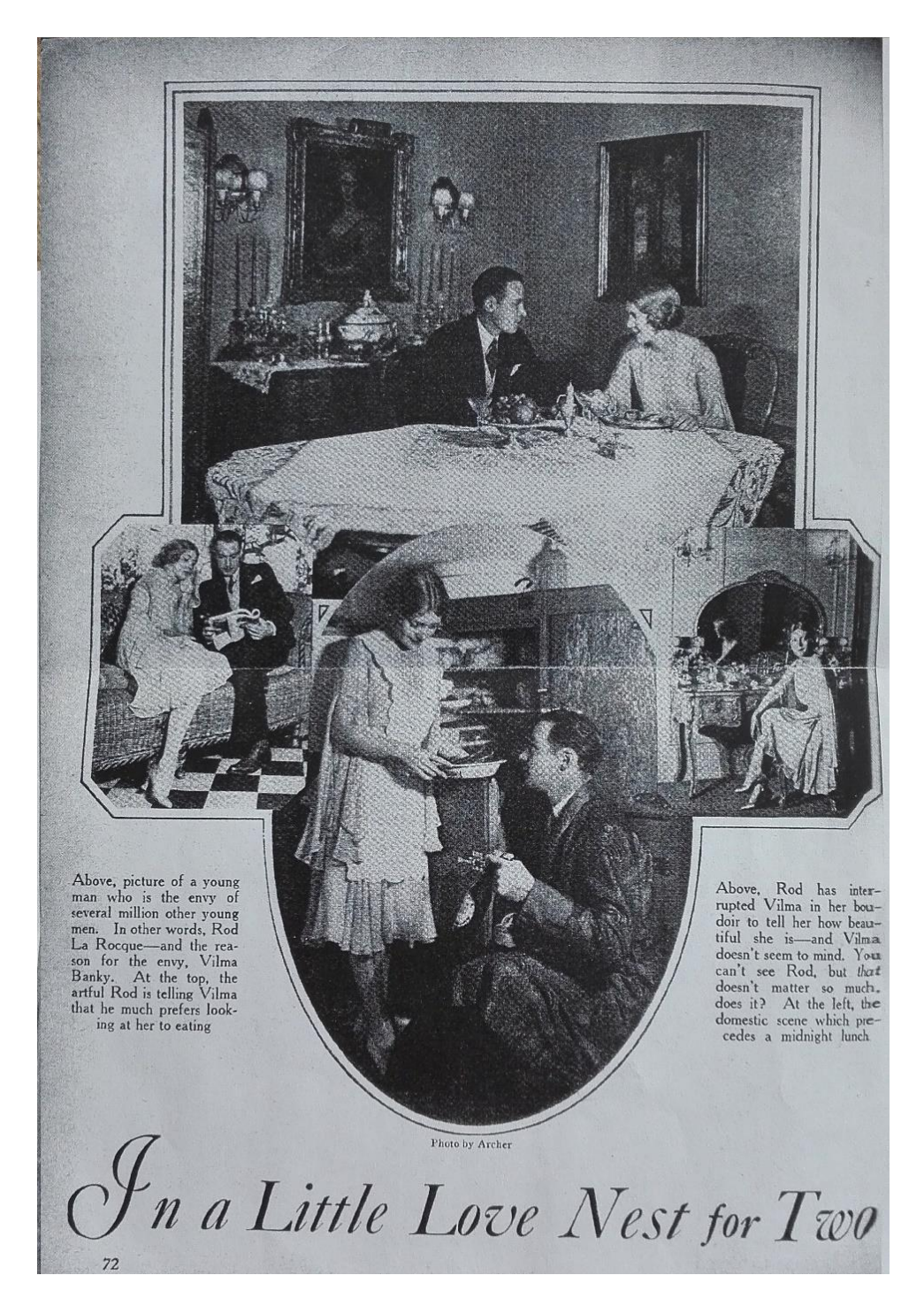
Figure 25. La Rocques in their domestic setting, as imagined by Motion Picture.

location [original emphasis].<sup>77</sup> The relevance of Dixon's claim manifests itself through the comparison between pictures capturing La Rocque's home – their modest but classic furniture – with the grandeur and opulence of houses belonging to stars acclaimed for their eccentricities, such as Gloria Swanson or Pola Negri.<sup>78</sup>