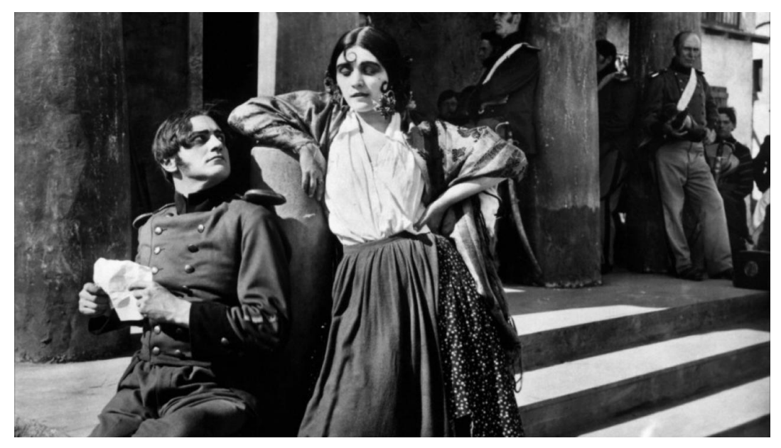
Figure 3. Seductive Carmen: Negri in a scene from Gypsy Blood (1920)

the changing political climate. Indeed, the historical period under discussion here witnessed a number of societal shifts, mainly in relation to the visibility of women in the public sphere. The ratification of the Nineteenth Amendment in the USA in 1920 granted women the right to vote, which – alongside the increase in numbers of female workers –was viewed by the defenders of traditional gender roles as a threat to the status quo . Scholars of the 1920s, such as Nathan Miller, write that for conservatives, it seemed as if the new generation of women was usurping the male prerogative.<sup>41</sup>