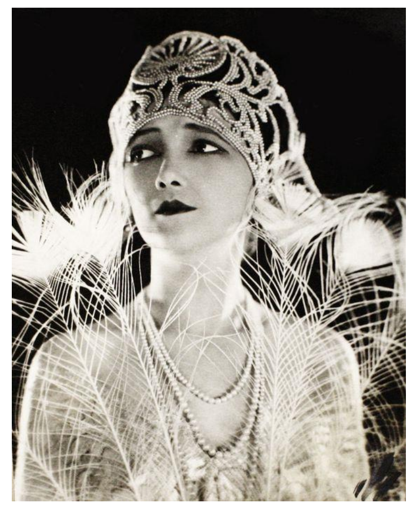
Figure 26. Goudal, adorned by feathers and pearls, in an undated photograph.

garments featured prominently in publicity-generated, consumable images of Goudal. An undated, unattributed photograph of the star frames her face with a layer of ostrich feathers (Figure 26). This is significant because, allegorically speaking, plumage has a strong relation to a certain type of threatening femininity, as it is one of the most easily appropriable symbols of seduction in the animal kingdom.<sup>45</sup>