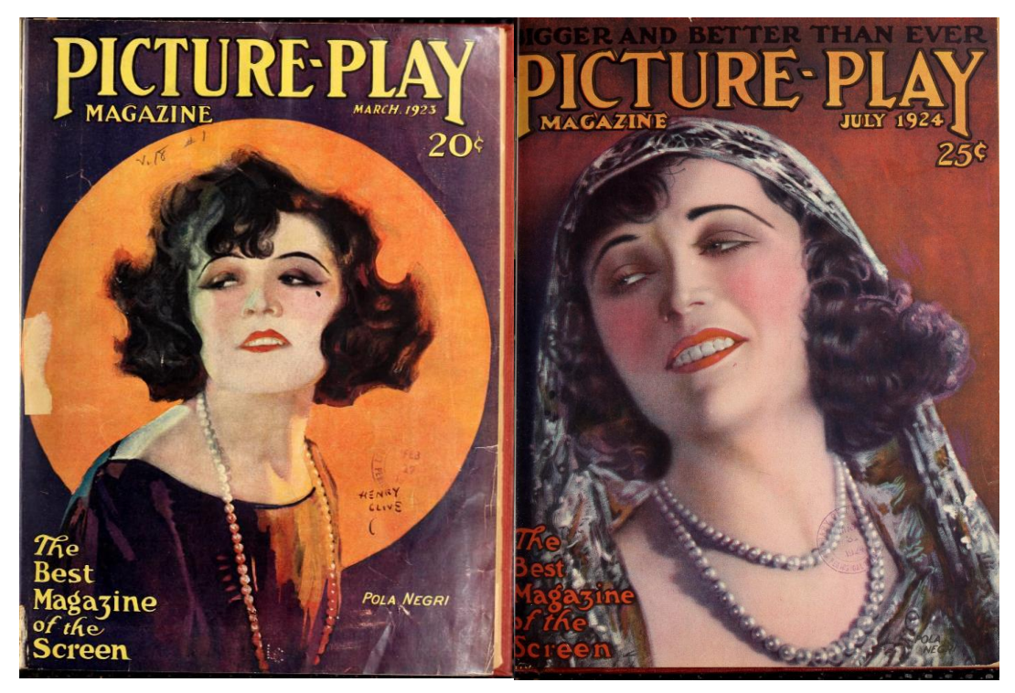
Figure 6. Negri epitomising the vamp on the covers of Picture Play in March 1923 and July 1924.

In addition, the dichotomised relationship between different types of white looks and opposing moral qualities echoed the period's approach towards issues of ethnicity.<sup>173</sup> Picture Play made a poignant observation in suggesting that screen vamping has long been the domain of the dark-haired woman that has 'to be poisoned or knifed to let the blond [sic] leading lady get the guy.'<sup>174</sup> Following a similar pattern, Reid's letter makes a clear distinction between the 'vamp' types, represented by Pola Negri, Barbara La Marr and Nita Naldi, and that of Americanborn, typically blonde leading ladies. The former 'fall short of beauty by the American standard, too, because they do not look natural, and an American beauty must be natural. Who ever saw anybody look like them?'<sup>175</sup>