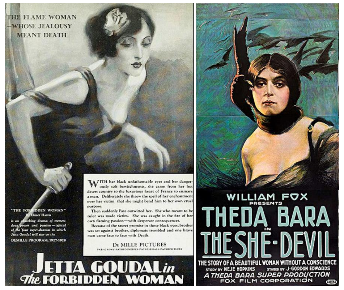
Figure 30. Dangerous women of the silent film. On the left, Jetta Goudal in The Forbidden Woman (1927). Right: Theda Bara in The She Devil (1918).

Jetta is one of those slender, sloe-eyed foreigners, galvanizing the lobbylookers into staring unabashedly. She looks like her name. Whoever decided to call her Jetta Goudal had a precocious gift for title writing. Indeed, one might say, succinctly and finally, of this svelte, exotic creature. 'Jetta is all that the name implies.' It's more than a name. It's a revelation. The Jetta suggests her black hair with the glossy high lights, the dark eyes, somber [sic] as night, glinting as steel.<sup>79</sup>