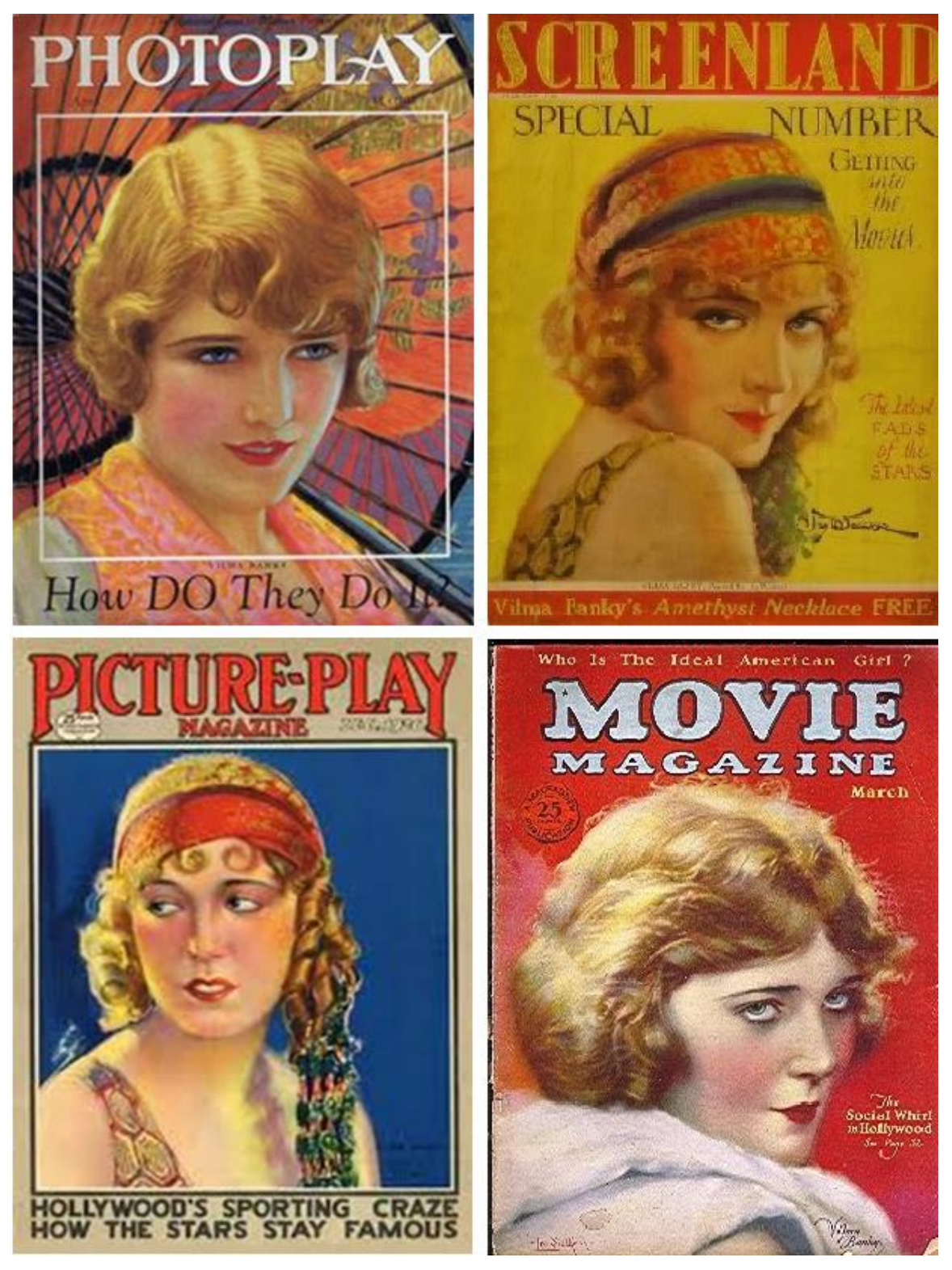
Figure 14. The cover girl. Bánky, as imagined on the covers of popular fan magazines. From the top, left to right: Photoplay , April 1926; Screenland , January 1927; Picture Play Magazine , December 1926 and Movie Magazine , March 1926.