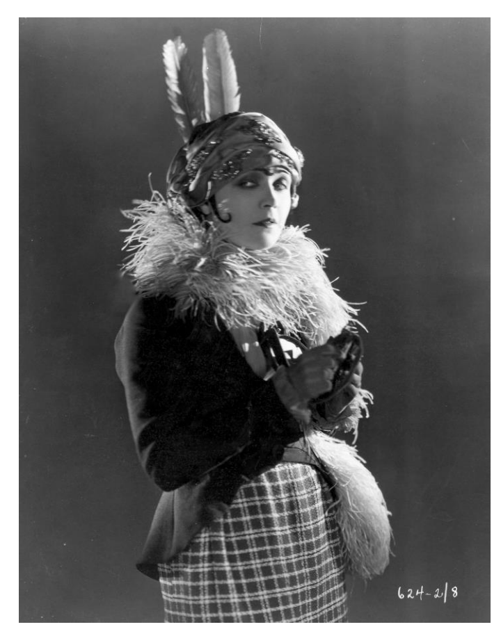
Figure 5. Negri as Blackbird: publicity still from Shadows of Paris (1924)

Aligning itself with a typical pattern of metamorphosis and upward class mobility, the plot of Shadows of Paris followed Negri as Blackbird, a brazen dancer of the Parisian underworld<sup>138</sup> who, upon learning her lover and a fellow gang member has been killed on the battlefield, assumes a new identity.