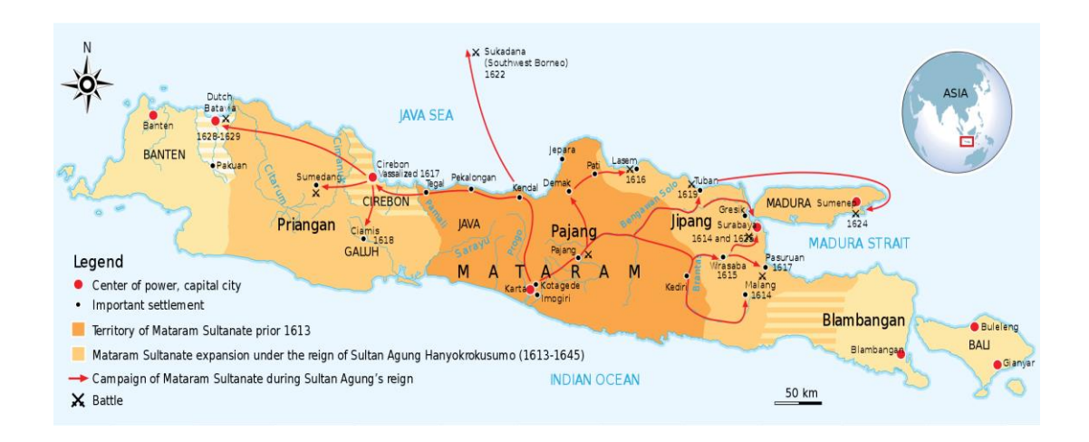
Figure 4. Map of the Mataram Islamic Sultanate

Since the beginning of the sultanate system, sultans had attempted to unite Islam with Javanese beliefs. Sultan Agung (ruled 1613–1645), for instance, combined the Islamic and Javanese calendars into a new hybrid. This type of approach to their unification was continued by his successors, especially by Sultan Pakubuwana II (ruled 1726–1742) (Ricklefs, 2006, 2007). Therefore, the sultans played a significant role in creating a particular character of Javanese or indigenous Islam, and this kind of Islam enabled people in Java in particular to feel more accommodating towards Islam by removing the dilemma of choosing between being Muslim or being Javanese. On the one hand, they embraced Islam as their religion, whilst on the other they retained Javanese faiths, such as believing in Ratu Kidul – the local Goddess of the Southern Ocean (Ricklefs, 2006).