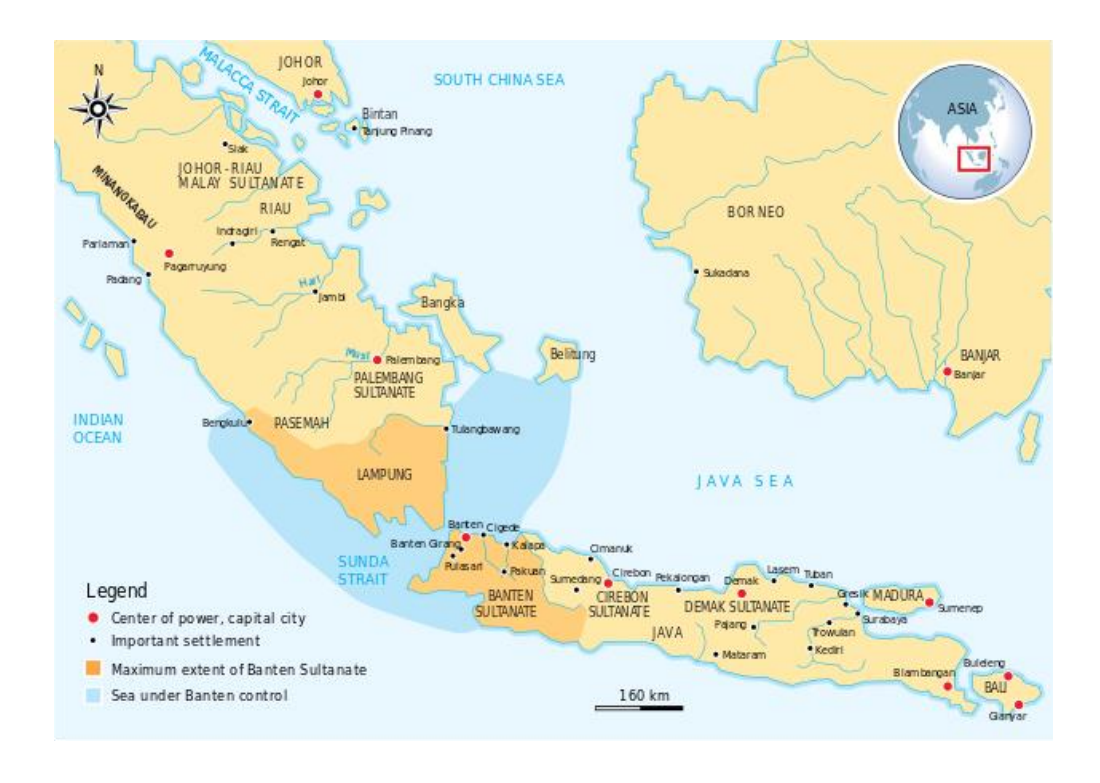
Figure 3. Map of Demak Sultanate