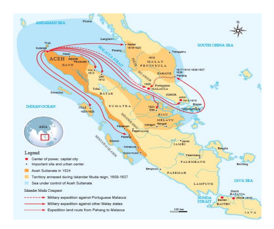
Figure 2. Map of the Aceh Sultanate