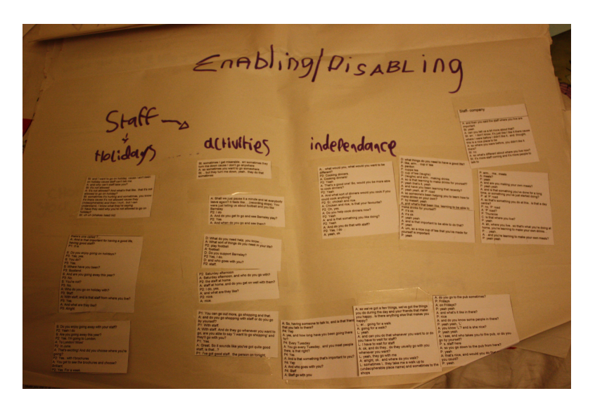
Figure 3: Data extracts cut out and moved around to form broader themes

Codes and corresponding data extracts from all participants were then typed up and cut out to allow researchers to physically experiment with placing them together to form broader 'themes' (see Figure 3).