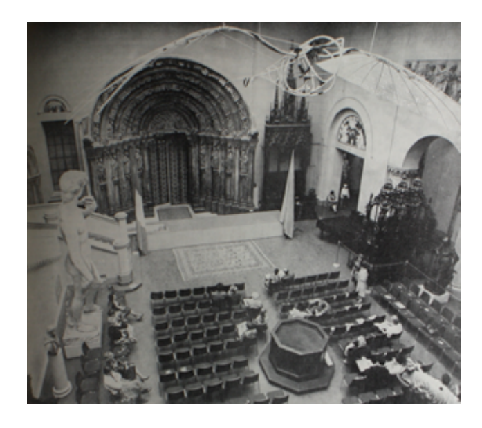
Image 37 | Letatlin on display at the Paris- Moscow exhibition, Pushkin Museum, 1981.